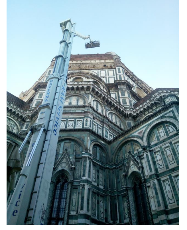
Fig. 3. November 2018, the photogrammetry campaign of the Florentine Cathedral: northern absis.

The possibility to have three photographers at time during the operations allowed a specific strategy: two full-frame cameras (Nikon D800) with the same lens (Nikkor 35mm F2) mounted on tripods, taking parallel shots from the two sides of the platform and a third camera (Sony Alpha 7r, mounting a Sigma Macro 50mm F2,8 or Pentax K1, mounting a Sigma 35mm F1,4), handheld and used to take angled, detail and specific shots accordingly to the area of intervention.