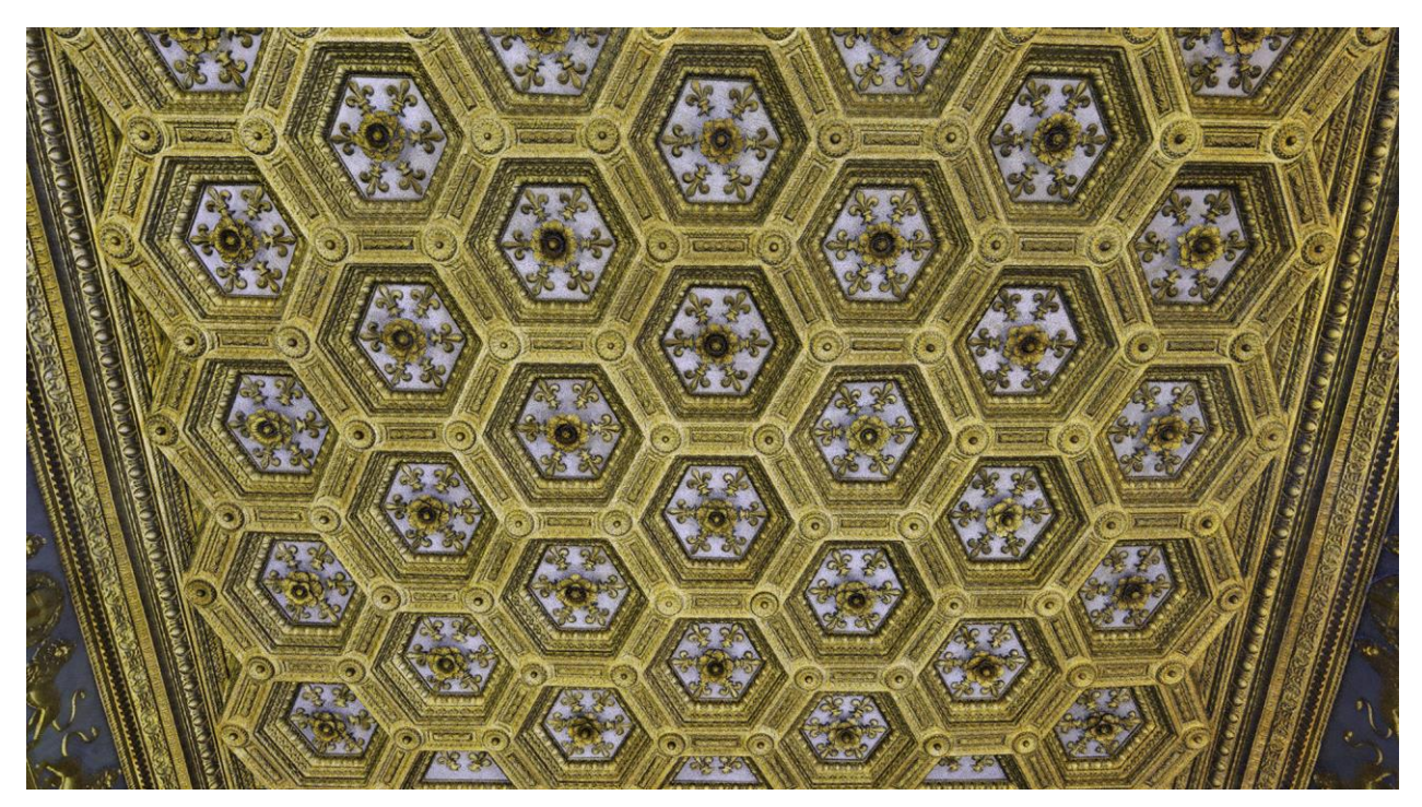
Fig. 6. Palazzo Vecchio, Lasergrammetry: Ceiling of "Sala dei Gigli", Leica Geosystem RTC 360 scanner unit (Source: own's, the author).

At the moment of the writing the reconstruction of the final, first, a global point cloud of Palazzo Vecchio is yet ongoing. The processing of assembling large areas to postpone the reunion to a final moment seems to work fine accordingly to the intention to use Autodesk Recap for the above-mentioned reasons. The following operations, the creation of 2d drawings and 3d parametric models as the bases for the seismic study will produce an extreme simplification on the general level of details, but all the data will remain in the "original" dataset for further use. The identification of a series of worthy subjects is gradually bringing on specific studies and a line of master's degree thesis in Architecture.