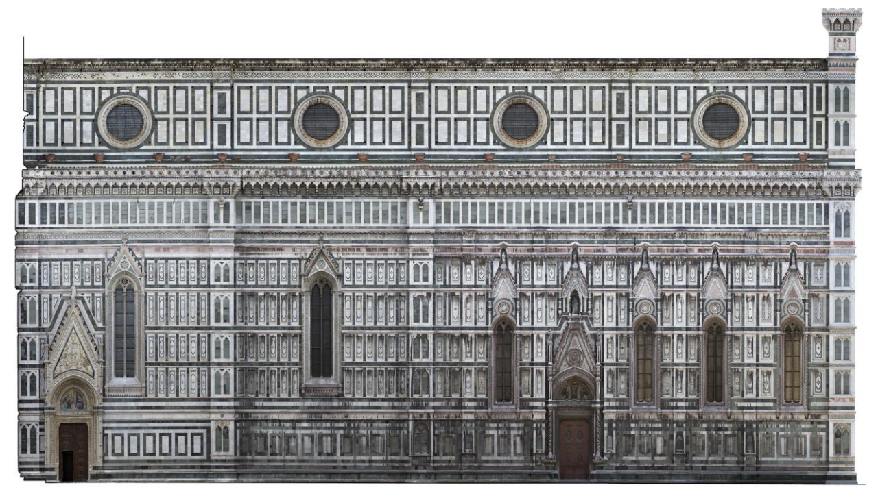
Fig. 4. Northern Front of the Florentine Cathedral, final processing of the photo plane, orthographic projection, original resolution: 152.536x86.070 pixels.

management, visualization and virtualization of the whole monument. A simplified version of the materials produced during the Cathedral survey is visible and browsable in the Sketchfab.com community, in the profile of the DiDALabs Architecture Photographic Laboratory (sketchfab.com/L.f.A-DiDA-UNIFI).