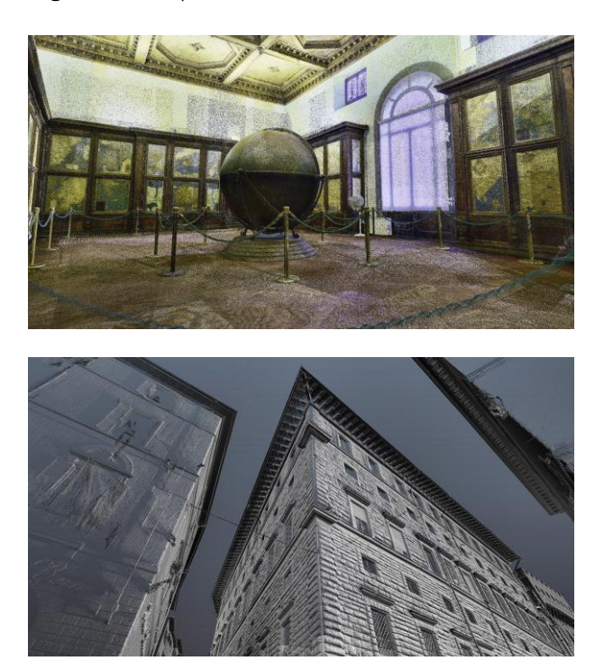
Figg. 7-8. July and September 2019, the Lasergrammetry of Palazzo Vecchio, Florence, internal and external views of the aligned point clouds.

complexity of an object compared to traditional survey techniques corresponds to a greater benefit, practicality and advantage in the use of digital techniques ".