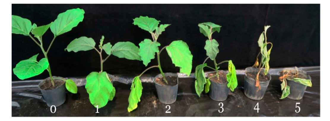
Figure 1. Disease rating scale 0–5 according to [35], where 0 = no symptoms, 1 = only one leaf partially wilted, 2 = two or three leaves wilted, 3 = all leaves except two or three wilted, 4 = all leaves wilted, and 5 = plant dead.