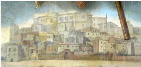
Fig. 1. Church of Santi Valentino e Damiano, detail of the painting painted by S. Giannini (Author, 2012).

It is the imagine of the castrum in stones mentioned by the sources, intended in its complexity as a progressively fortified residential perimeter; the same can again be seen in the painting by S. Giannini (1848) preserved in the church of Santi Valentino e Damiano (Fig. 1) which gives an idealized but substantially faithful view of the various stratifications over the centuries to project a castle-town at the end of the nineteenth century.