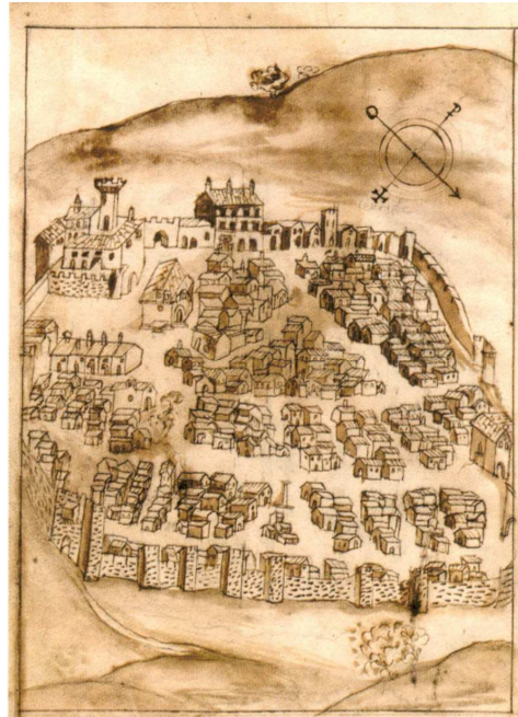
Fig. 2. “Summario dell’Intrate che’l Serenissimo Signor Duca di Parma e Piacenza tiene nella provincia d’Abruzzo. Aquila ultimo gennaro 1593” (Chiarizia, Latini, 2002, fig. 387).

Such is difficult to trace in the distinctive architectural features of the building, however, it is legible at urban level in those areas that are extended over blocks of land identified by road layouts forming a fusiform urban pattern interrupted by a secondary road system consisting of ramps and climbing roads.