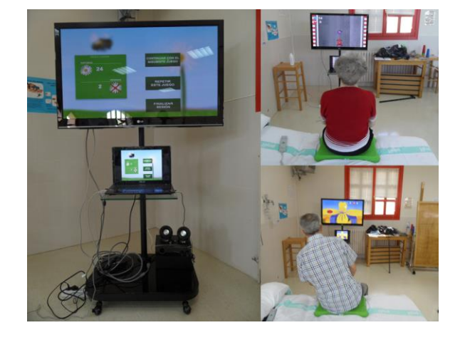
Figure 1 Patients with PD using the ABAR system

When the participants maintained the position to achieve the targets, we selected the pressure that the participants performed when