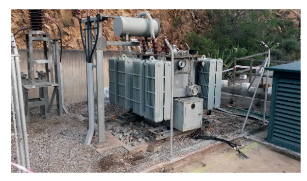
Figure 2: Adequacy of power transformer (Endesa Generación-Enel Green Power).

The actions that have been mainly indicated as a function of the analyzed faults, indicate a series of actions grouped in: