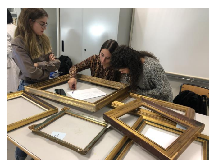
Fig. 2 Cooperative Learning Font: Own font

When the students were clear about their hypotheses, regarding the practice, they put everything in common, through the technique of brainstorming, trying to understand the technique of gilding of the frames and the materials used for it. The data that each of them was appointing, in practice, was being recorded in a portfolio that the faculty had prepared, with the questions they had to discuss and the aspects to which they had to pay attention to.