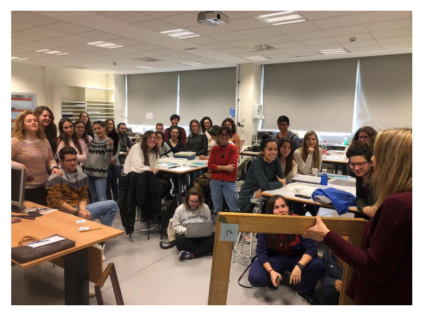
Fig. 3 Resolution of the practice

When the students completed the activity, a pooling of the 15 groups, referring to the whole practice, was carried out, drawing a series of conclusions, which were being led by the teachers, coming to the resolution of each of the analyzed cases.