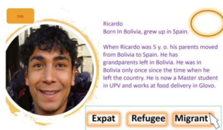
Pic. 2 Second level of the game "Expat bubble or Migrant struggle?"

level. Points are discounted if there is no gender balance or ethnical diversity. At the end of the level, he is shown a leader board of other people who passed the level before him and who make gender-balanced and ethnically diverse choices in the shortest period of time. The personal score is displayed, and the level of gender and diversity in the team. The option to replay the level is offered as well.