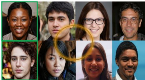
Pic.1 First level of the game "Gut reaction"

Ideally, if the player is male: among ten chosen candidates, at least five women should be included. If the player is a female among ten chosen candidates should be at least five males. If less, in-game hints about diversity and inclusion will be offered to read. A player starts a level with some complimentary points. If the player makes a good gender balance during this level, he is given points for keeping gender balance and ethnical diversity at the end of the