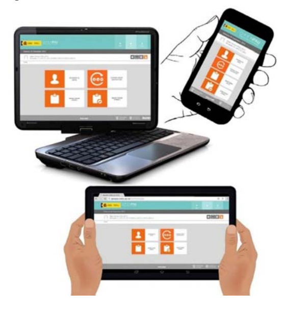
Figure 1: Language learning m-learning environments of the OPENPAU project (Spain) [Magal-Royo, 2017]

become a prevailing trend within e-learning [Ozdamli, 2015] [Uzunboylu, 2015] that has led to the increasing importance of ubiquitous learning environments (u-learning) [Casey, 2005]. Adaptive mobile assessment systems have been developed in a number of cases [Huang, 09] like the SEMS [Kaiiali, 16] but none for foreign language learning. Thus, the importance of combining both issues represents a great advantage for many institutions in external standardized exams such as the university entrance examinations worldwide [García Laborda, 2016]. However, it is necessary to improve means and methods to achieve better listening sections that overcome the current problems in listening tasks in mobile devices. To achieve this goal it is necessary to find new multimodal ways to make listening task more efficient and adequate to the need of mobile devices. As it can be seen in figure 1, from the OPENPAU project (Spain) (FFI2011- 22442), there is variety of m-learning scenarios where listening for language learning takes place.