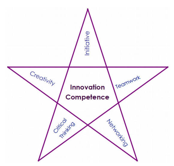
Figure 2. Proposed Model of Innovation Competence

(Cerinšek & Dolinšek, 2009; Derksen et al., 2011; Evers, 2005; Kairisto-Mertanen et al., 2012; Lukeš & Stephan, 2017; Marin-Garcia et al., 2013; Pérez-Peñalver, Watts, Marin-Garcia, Atarés-Huerta, Montero-Fleta, Aznar-Mas et al., 2016; The Conference Board of Canada, 2013; Waychal et al., 2011). For the first phase, creative-oriented work behaviour, we propose the dimensions of creativity and critical thinking, and for the second phase, the implementation phase, we propose the dimensions of initiative, teamwork and networking (Figure 2).