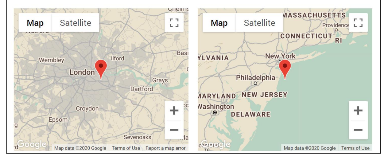
Figure 2: Display of year built and year fate in the Ship History Section.

Ship Fate: Destroyed (Sunk/Destroyed by Enemy Force)