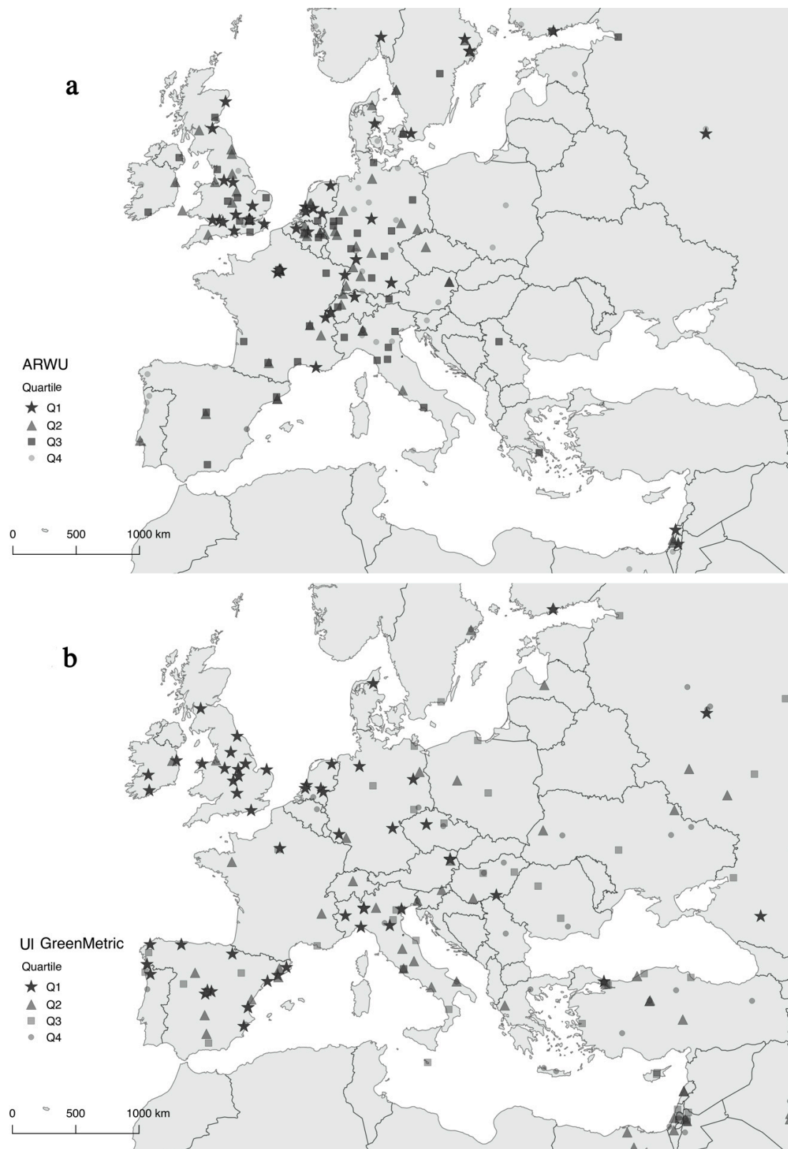
Figure 2. Geographical distribution per quartiles of the Top 500 European universities in the ARWU ranking (a) and the UI GreenMetric ranking (b).

As for the distribution of universities per typologies (Table 2), in the Top 500 of the four GURs, more than 80% of universities were public (78.6–85.2%). Moreover, most were non-technology