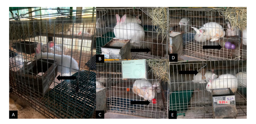
Figure 2: Positioning of the objects in the cage. A=CH group; B=CS and CH groups; C=RB group; D=FT group; E=CF group.

The behaviour data was submitted to the Kruskal-Wallis test. For evaluations of rabbits lying down, being fully stretched out, biting the objects and sniffing the objects, the Mann-Whitney test was applied to analyse significant