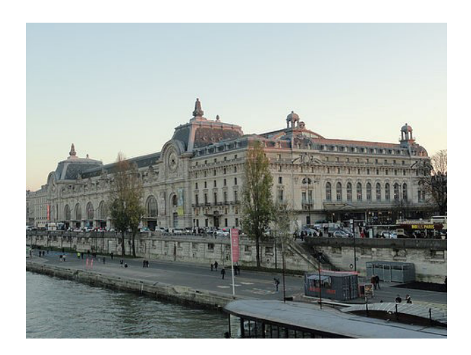
Figure 3 | Musée d'Orsay.