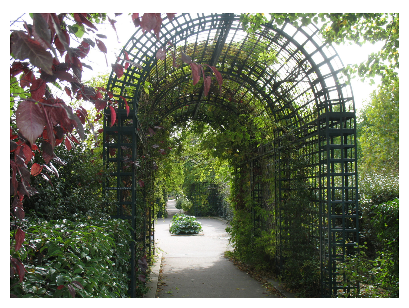
Figure 5 | . Promenade Plantée.

Therefore, unlike the Gare d'Orsay , its building was not valued as an architectural monument, giving way to the new building of the "Paris Opera", inaugurated in 1989, occasioning the disposal of waste from the demolition of an old building and the use of new materials for the construction of a completely new one on the same site.