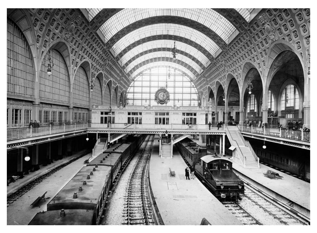
Figure 1 | View of the nave of the Gare d'Orsay.

It cannot be stated that this survey has a direct relationship with the most used ways of preservation in the country, as there is a wide variety of railway heritage buildings reconverted to other uses. On the contrary, we can affirm that the recognition of this infrastructure has fostered the preservation of several buildings. However, the concern with the urban landscape was also a reason for the versatility of the reuse projects implemented, a subject that cannot be disregarded.