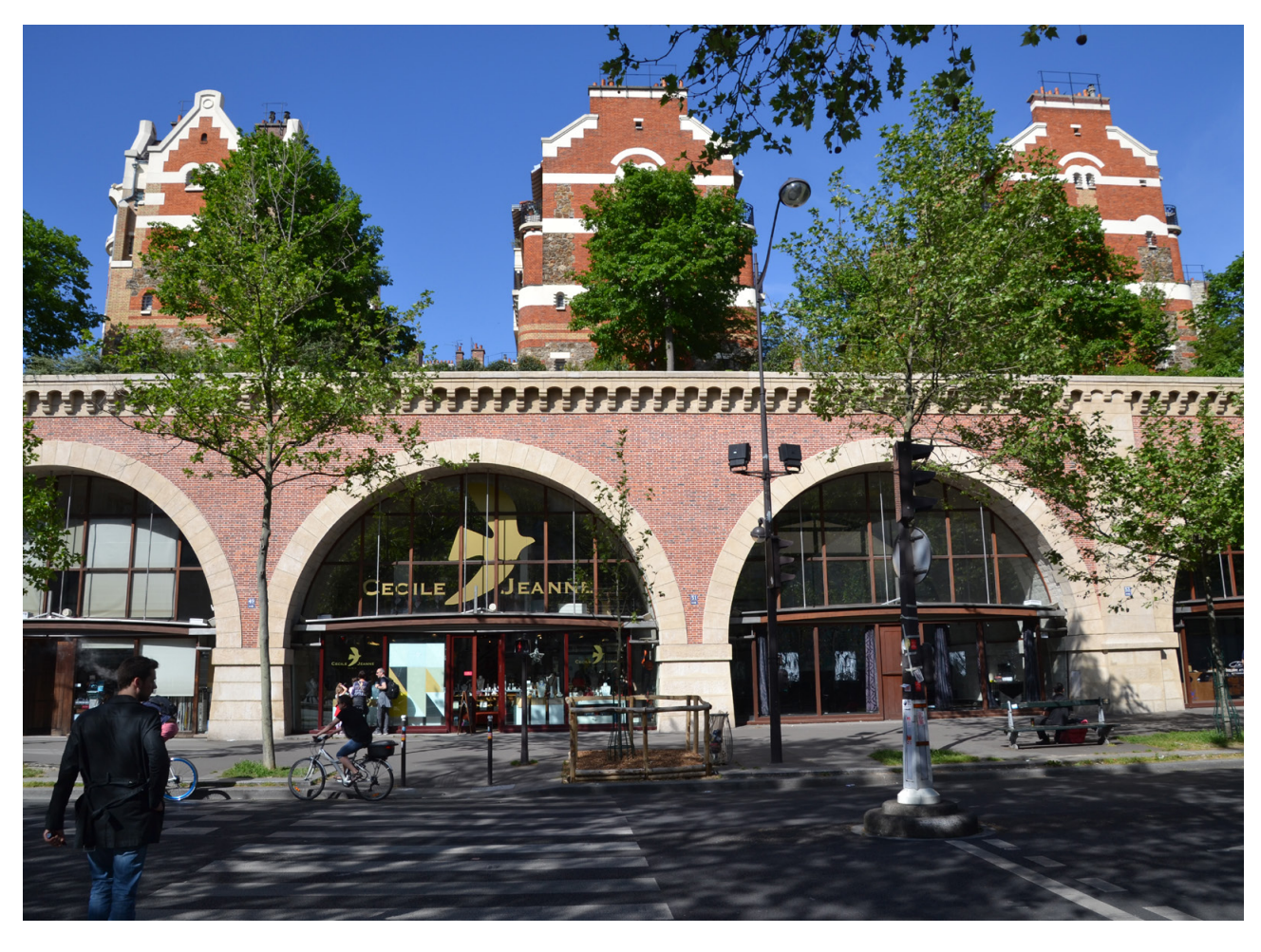
Figure 6 | . Promenade Plantée Viaduct.

The Mussée d'Orsay analysis focus on the reuse of a railway building that lost its former function and was reconverted into a space for artistic manifestations, "contributing to regenerative spatial and urban planning" (ESPON, 2020). Its reconversion avoided the construction of a new building, reducing the waste disposal, and the need for a new contingent of raw materials or the consumption and transportation of new construction materials.