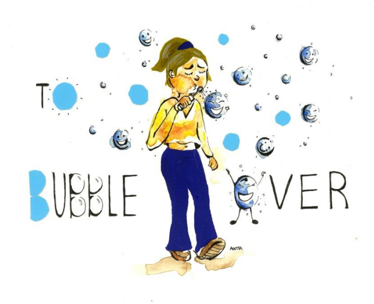
To bubble over, 210x 297 mm, Acuarela, 2021.