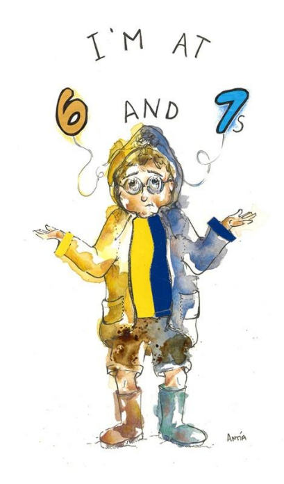
To be at sixes and sevens. 210x 297 mm, Acuarela, 2021.