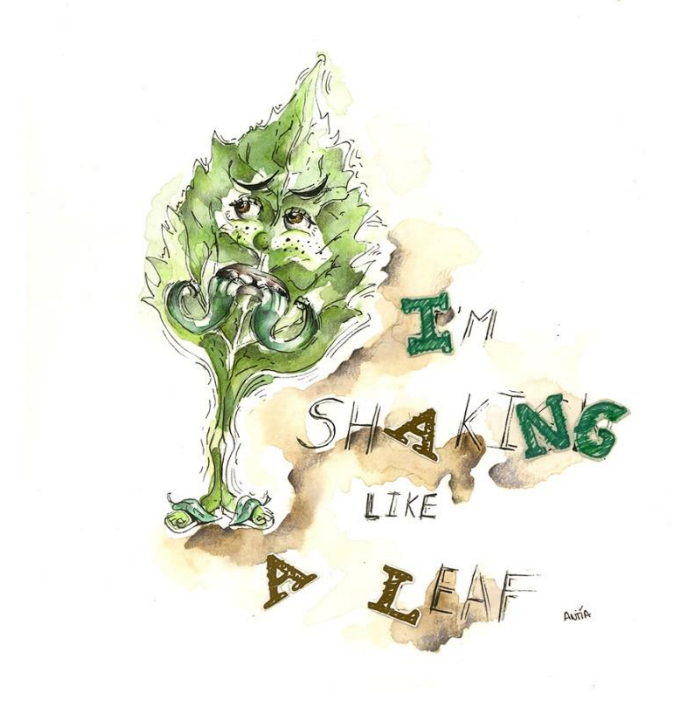
To shake like a leaf. 210x 297 mm, Acuarela, 2021.