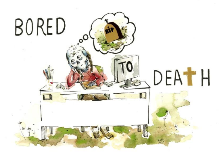
To be bored to death. 210x 297 mm, Acuarela, 2021.