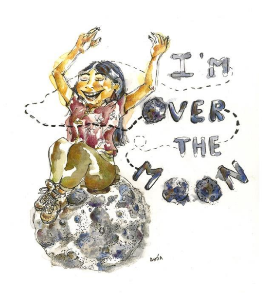
To be over the moon. 210x 297 mm, Acuarela, 2021.