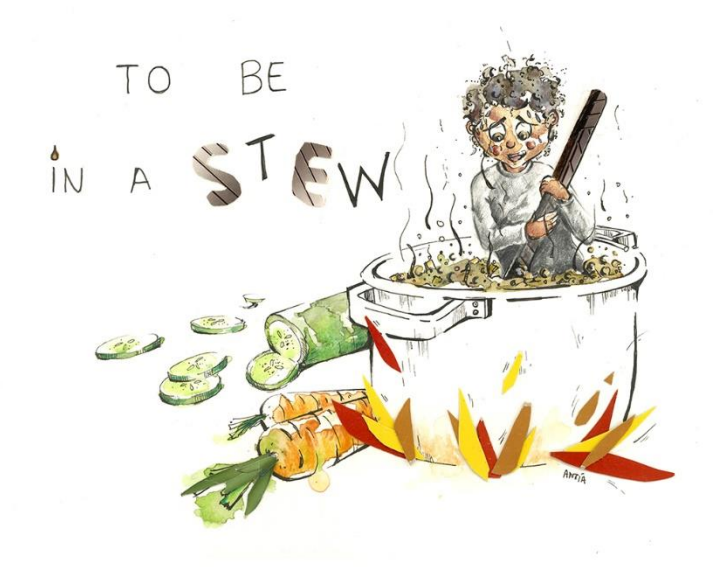
To be in a stew, 210x 297 mm, Acuarela, 2021.