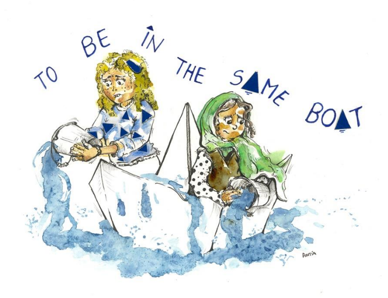
To be in the same boat, 210x 297 mm, Acuarela, 2021.