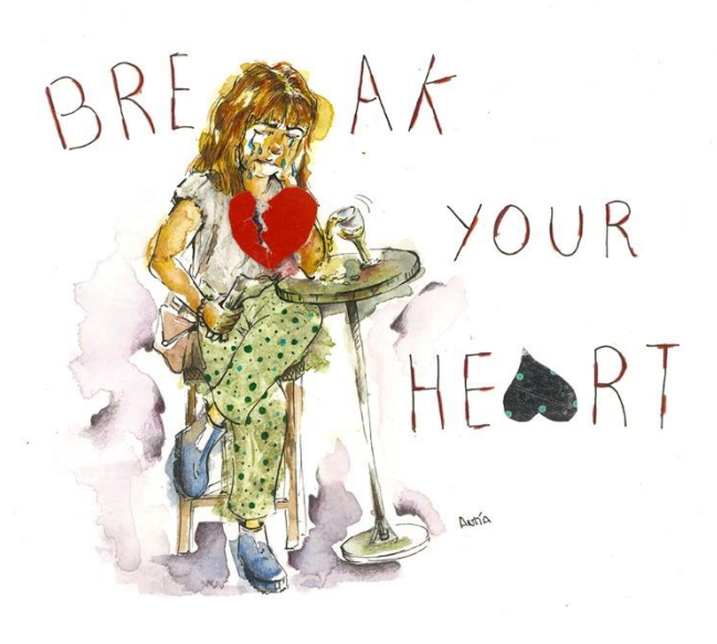
Break your heart. 210x 297 mm, Acuarela, 2021.