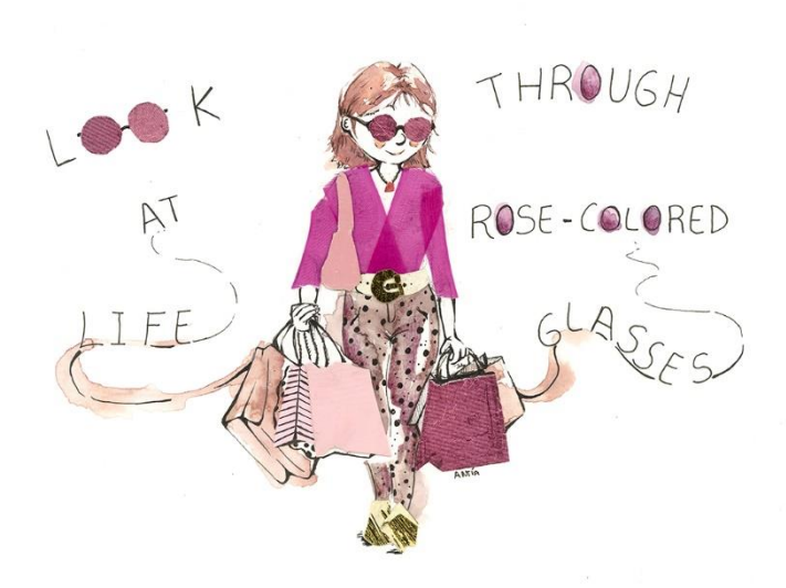
To look at something through rose-colored glasses. 210x 297 mm, Acuarela, 2021.