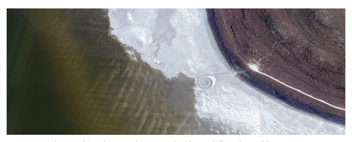
Figure 2. Aerial view of Spiral Jetty in the Great Salt Lake, Utah