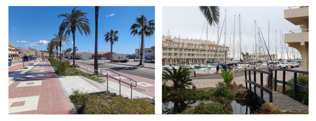
Figure 6. Landscaping in marinas, Caleta de Vélez (Málaga) and Almerimar (Almería), ES.