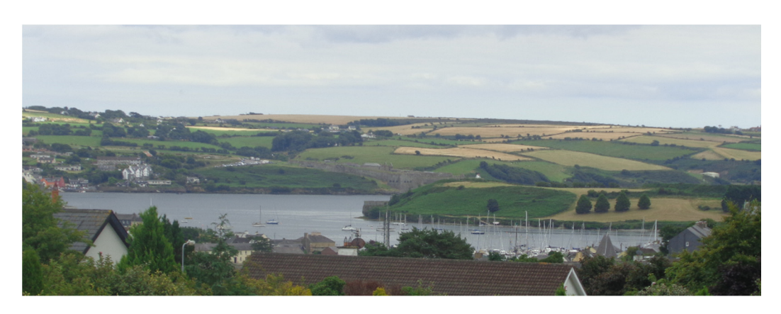
Figure 9. The identification of a marina unit's environment, Kinsale, IE.