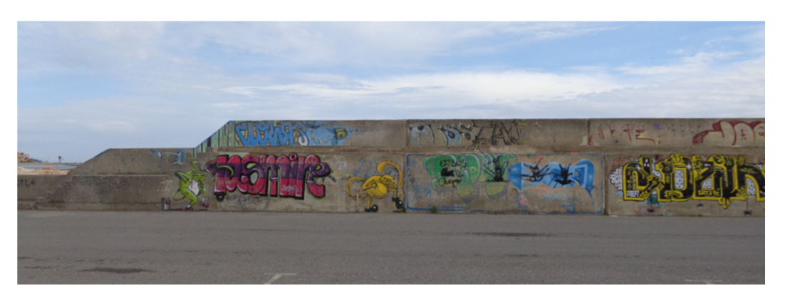
Figure 10. Maintenance of seawalls, Almerimar (Almería), ES.

Although landscape is a recurrent topic in the regeneration of waterfronts and derelict port areas [133,145,178–184], this issue is addressed to a lesser extent in marinas, sometimes in a vague and ambiguous way.