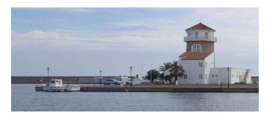
Figure 8. Port office as a landmark, Almerimar (Almería), ES.