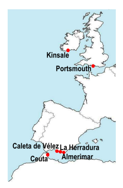
Figure 3. Figures 4–9 location map.