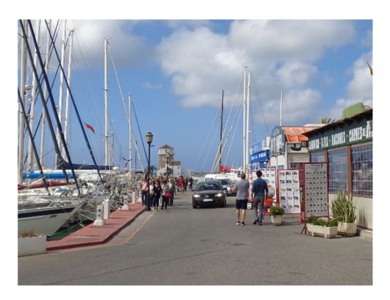
Figure 7. Incompatibility between pedestrian and vehicle traffic, Almerimar (Almería), ES.