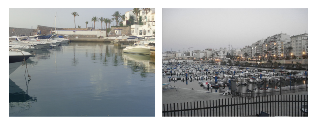
Figure 4. Viewpoints of the watershed depending on the distribution of the pontoons and boats, La Herradura (Granada) and Ceuta, ES.