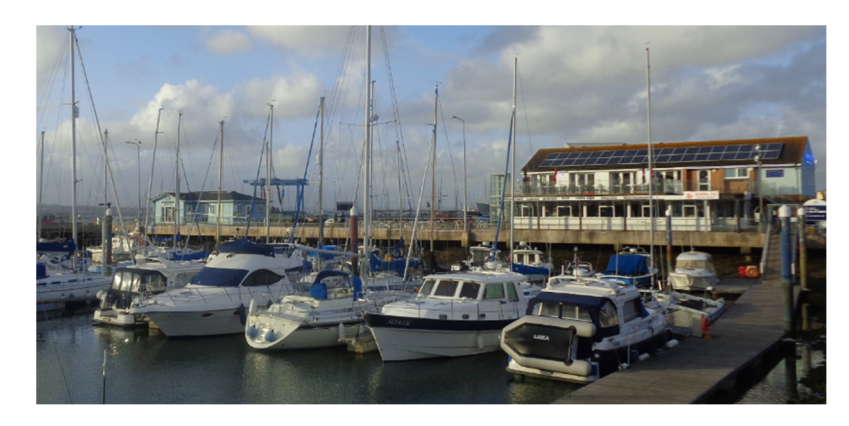
Figure 5. Location of elements with a great visual impact, Portsmouth, UK.

Figure 4. Viewpoints of the watershed depending on the distribution of the pontoons and boats, La Herradura (Granada) and Ceuta, ES.