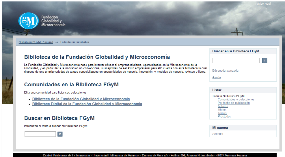
Main web page of the digital library

The DSpace welcome page has been customized to adopt the same design, as described in the section "2.3. Integration needs with the current web platform"