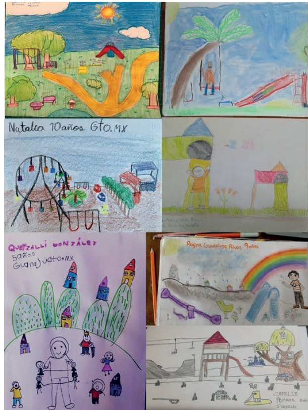
Figure 3 | Interpretation of the collective imagination of children from the Central-West region of Mexico towards Gulliver Park in Valencia, Spain.

The workshop arose from the need to know how the collective public space is perceived from the children's vision of the world with the pedagogical method "Reconnect with your culture".