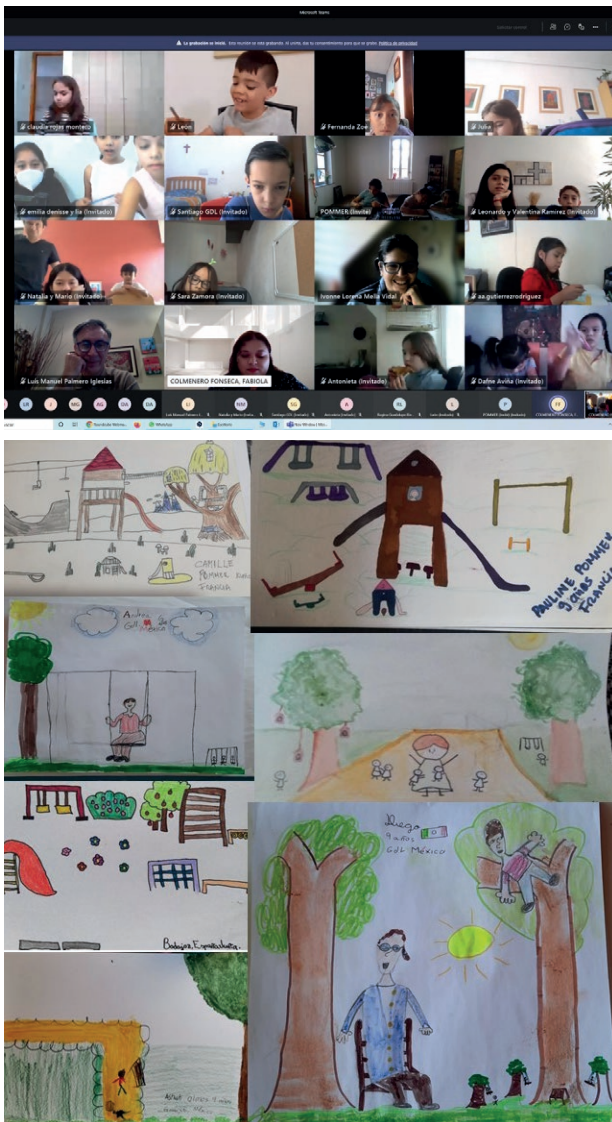
Figure 2 | Interpretation of the collective imagination of children from Spain, Mexico, Italy, and France towards Gulliver Park in Valencia, Spain.