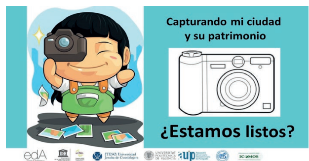
Figure 4 | Poster design and activities for the Architecture for Children workshop.

It was oriented to reveal the child's perception of his/her city and explore the value of the heritage that it may have; the child will be guided to explore his/her memories of walking through the city and find his/her public space; for this, the children will make a drawing with the free technique of "how they perceive the city from the interculturality and their local cultural heritage".