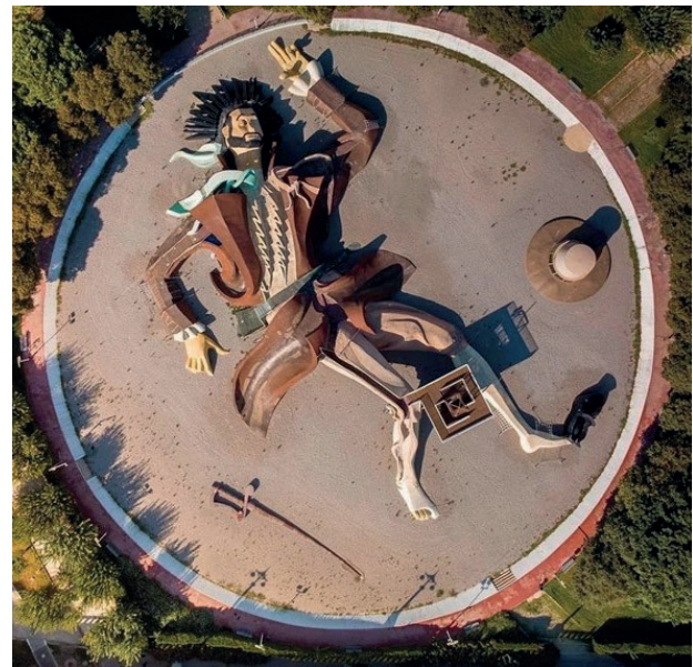
Figure 1 | Gulliver Park in Valencia, Spain. Photo: @primetones 2021.

#socialimaginaries #citiesforchildhood #childhood #collectiverepresentations #iconology #reconstructionofheritance