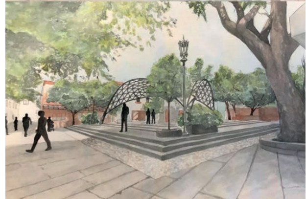
Figure 10 | Photographic record and design proposals in a heritage public space in the city of Guanajuato, Mexico, based on the empirical experience of the architectural gaze of ITESO University students.

to adults over 80 years old. Through the design of public spaces that meet the needs of this vulnerable population group, including children, the elderly, people living in poverty or with physical or mental disabilities, and all ethnic groups.