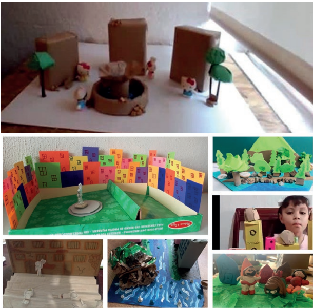
Figure 9 | 3D representations of tangible and intangible and natural heritage in their city of origin.

what heritage there is in their city, to then make a model with recycled materials that they can find at home.