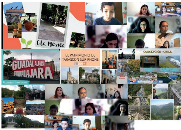
Figure 7 | Heritage and accessibility panel of their hometown through the presentation of a collage/video.

We had the registration of children from 6 to 17 years of age from all over the world, with a total of 34 workshop attendees from Canada, the United States, Mexico, Colombia, Chile, Spain, and Italy.