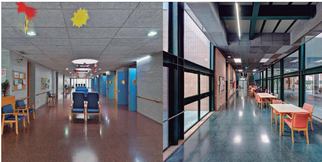
Figure 1: Current state of the residences in Manises (a) and Chiva (b).

To develop the architectural project for each one of the three residences selected, scholars and professors visited the places and recorded all the information needed, not only about the forms and colors of the existing buildings, but also about the problems that users and staff perceive in day to day. In the case of Velluters, Chiva and Manises, the architectural spaces were characterized by having a chromatic scene that tended towards white and neutral or very clear colors (Figure 1). From a perceptual point of view, the spaces were cold and impersonal, thus being spaces of an institutional aesthetic. Some of the most common needs detected were difficulties related with glare, disorientation in big size rooms and a particularly concerning general lack of cosines. Definitely, users would like to feel like at home.