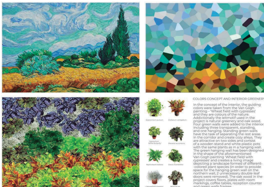
Figure 4: "We all love nature. Don't we?" by Olliwia Golenia & Anna Miroforidu.

The project "Circular Nature" works with the idea of an abstraction from nature. The colors are displayed on the glass walls in the form of silhouettes of the vegetation present in the garden behind it by using a self-adhesive foil on the windows. The silhouettes of the different types of plants or trees are completely made up of circles. Just like the very simple and easily understandable circular icons designed for the signals.