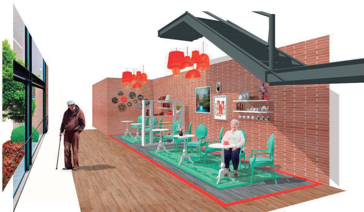
Figure 5: “ Recuerdos, sueño, hogar... ” by María Montserrat Cadena Velasco & Florencia Stilman.

Memories are connected to specific objects which are familiar to us. Following this idea, the project “ Recuerdos, sueño, hogar... ” (Figure 5) uses photographs, texts, postcards etc. to reach a deeper connection between spaces and inhabitants. Similarly, the project “ ...stand by them with colours ” (Figure 6) uses the iconography of ancient objects in different colors to help in the functional description of corridors which are too similar and banal.