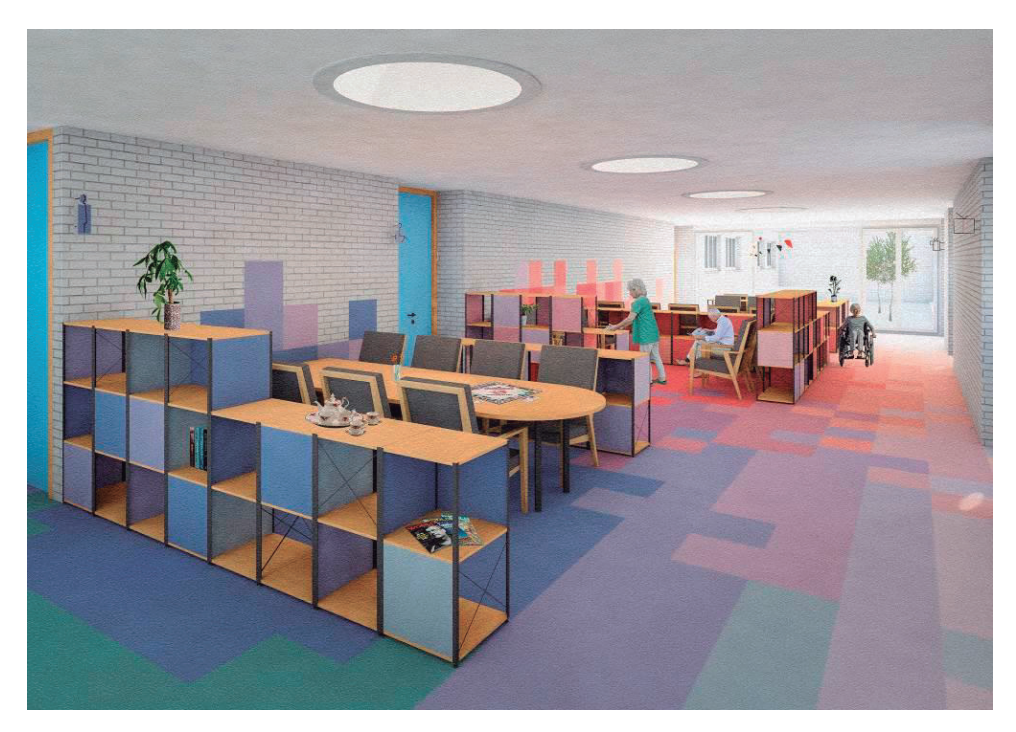
Figure 2: "Colourful Chessboard" by Mattia Tonini & Simon Hagen.

In the project "Colourful Chessboard" (Figure 2), the room of a wide corridor is divided in different zones intended for different activities and colors help in the description of these smaller areas. With a similar concept, in the project "Feel at Home", the main idea is to create integrated areas, divided but keeping the unity. Other times, like in "El día que mi abuelo se volvió color", the living spaces are drawn after the expression of the activity flows, by displaying different concentrations of holes in the ceiling. In this case, colors are subtle and display a neutral environment for living, after the understanding of specific architectures by RCR architects, Selgas Cano, or Peter Zumthor.