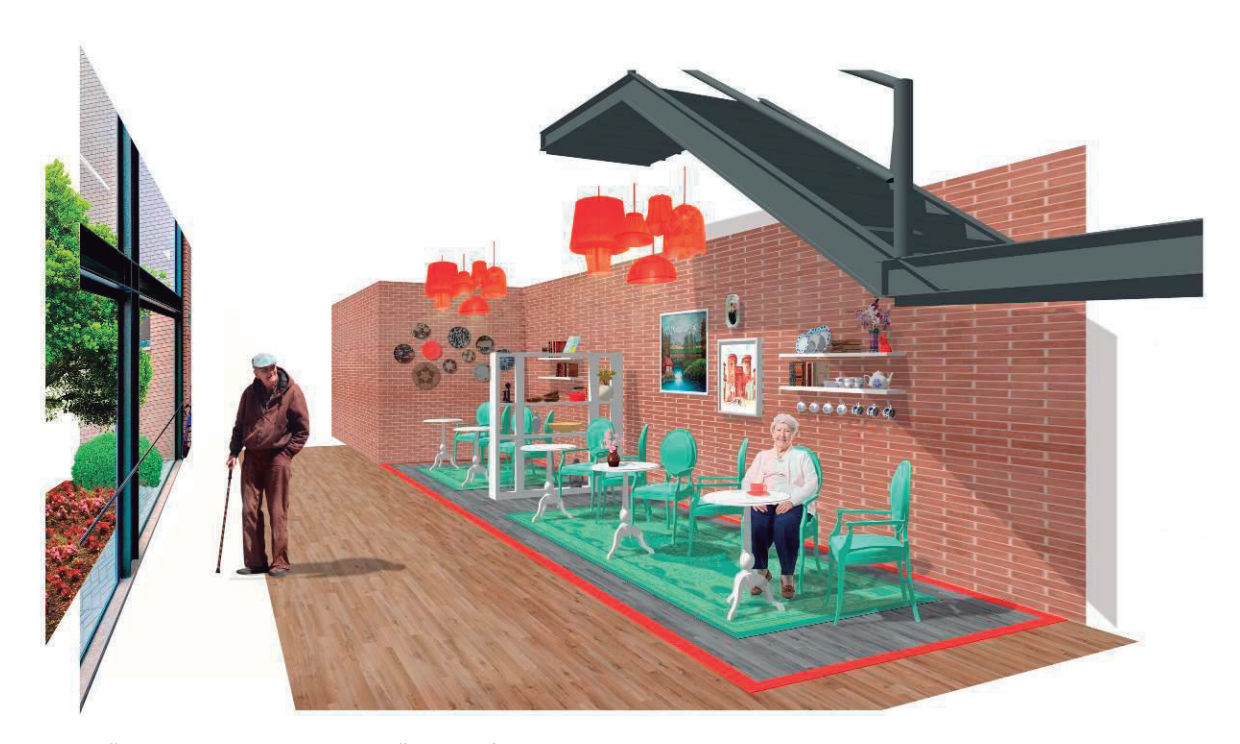
Figure 5: "Recuerdos, sueño, hogar..." by María Montserrat Cadena Velasco & Florencia Stilman.

Memories are connected to specific objects which are familiar to us. Following this idea, the project "Recuerdos, sueño, hogar..." (Figure 5) uses photographs, texts, postcards etc. to reach a deeper connection between spaces an inhabitants. Similarly, the project "...stand bye them with colours" (Figure 6) uses the iconography of ancient objects in different colors to help in the functional description of corridors which are too similar and banal.