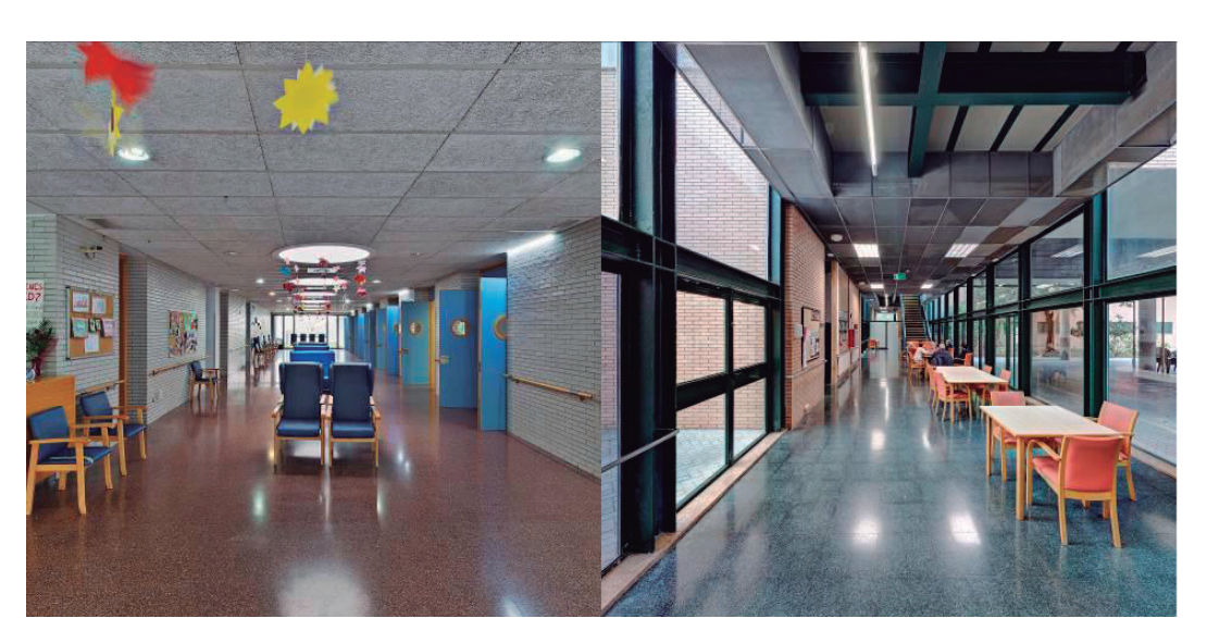
Figure 1: Current state of the residences in Manises (a) and Chiva (b).

To develop the architectural project for each one of the three residences selected, scholars and professors visited the places and recorded all the information needed, not only about the forms and colors of the existing buildings, but also about the problems that users and staff perceive in day to day. In the case of Velluters, Chiva and Manises, the architectural spaces were characterized by having a chromatic scene that tended towards white and neutral or very clear colors (Figure 1). From a perceptual point of view, the spaces were cold and impersonal, thus being spaces of an institutional aesthetic. Some of the most common needs detected were difficulties related with glare, disorientation in big size rooms and a particularly concerning general lack of cosines. Definitively, users would like to feel like at home.