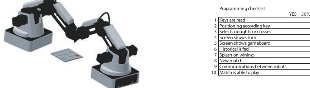
Figure 3. Work template for session 2.