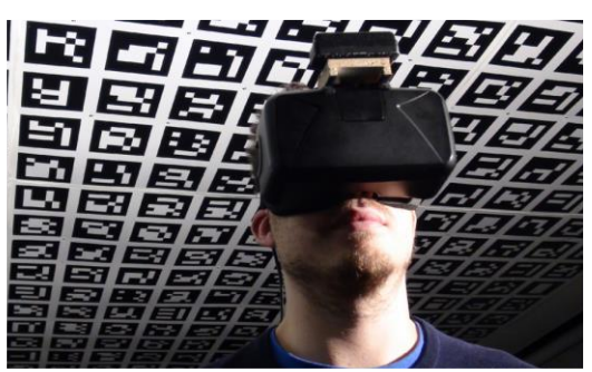
Fig. 4. Walking VR System, image adapted from [11].

The system consists of an Oculus DK2 (Oculus VR, Menlo Park, USA), a PlayStation Eye Camera (Sony Corporation, Tokyo, Japan) attached to it pointing upwards, and a 3.78 m by 5.7 6m pattern of 442 fiducial markers installed on the ceiling [11], depicted in Fig. 4. The system runs on a laptop with an 8-core Intel Core i7 Haswell 2.50 GHz, 8 GB of RAM, and an NVIDIA GeForce GTX 860M 2GB. It uses the Oculus DK2 HMD native orientation tracking while the position tracking is done inside-out through the camera input, i.e. , the HMD tracks its position relative to the markers. When the user is at standing height, this system has a mean positional accuracy of 0.94 cm, a mean jitter of 0.10 cm, and a mean latency of 120 ms. The display specs are the standard for an Oculus DK2, a FOV of 100°, 960 x 1080 pixels per eye resolution, and stereoscopy.