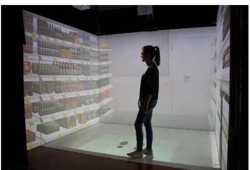
Fig. 3. Low-cost CAVE powered by the KAVE software.