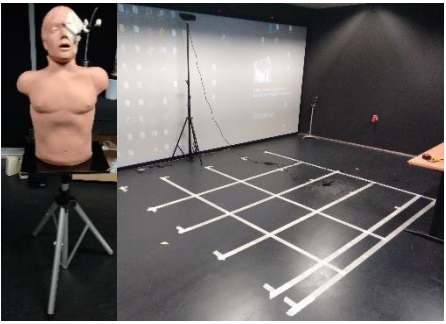
Fig. 2. The mannequin and tracking space used