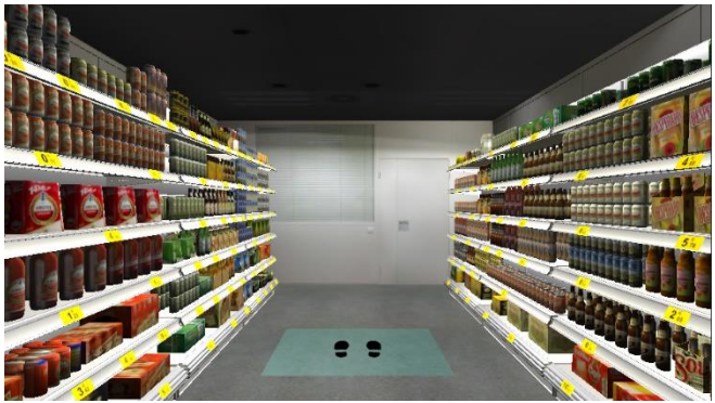
Fig. 6. The virtual environment used in the study.

After the first assigned experimental condition, participants were asked to rate their cybersickness on a 7-point Likert scale. Then reported their sense of presence in the original Slater-Usoh-Steed Questionnaire [18] (SUS) and a modified version of the Presence Questionnaire [19] (MPQ), which were previously applied in combination with the VE used in this study [11]. The SUS and MPQ are 3-item and 21-item questionnaires, respectively, rated on a 7-point Likert scale. They were then asked to return on a later date to repeat the same procedure with the other experimental condition.