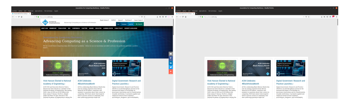
Fig. 1. Main webpage of ACM's website and its main content (extracted with our web content extraction tool).

The main content is a key element for indexers and crawlers: