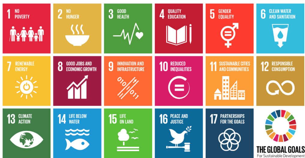
Figure 1. Sustainable Development Goals

Note: this figure is licensed under CC BY-ND