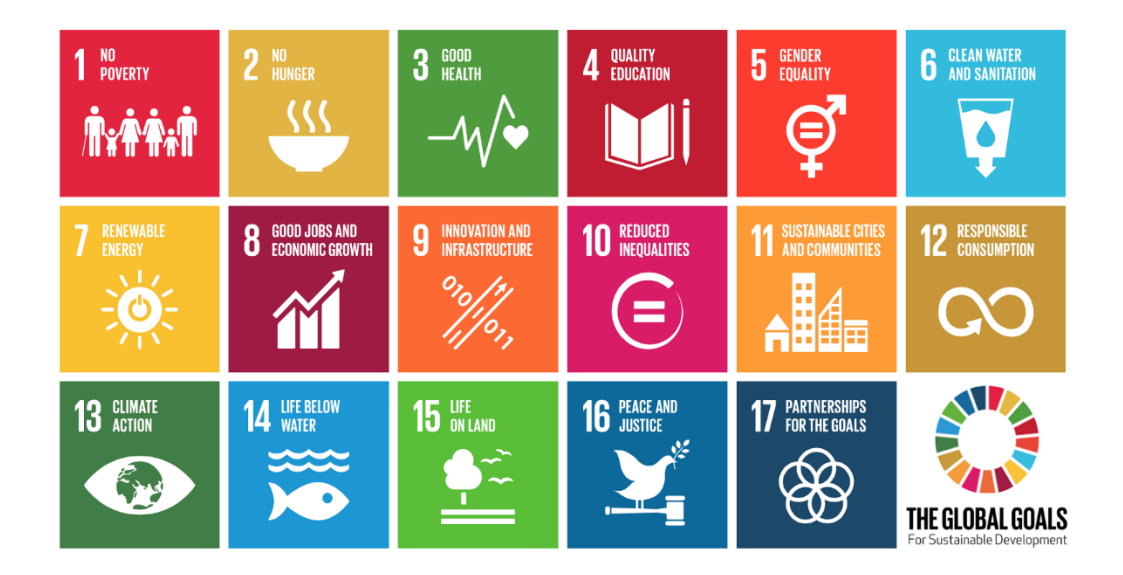
Figure 1. Sustainable Development Goals

Note: this figure is licensed under CC BY-ND