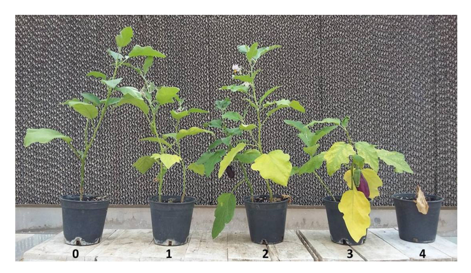
Figure 2. The varied visual disease symptoms occurred on the eggplants inoculated with Cmm due to the disease severity ranged from a (0) symptomless plant to a (4) dead plant