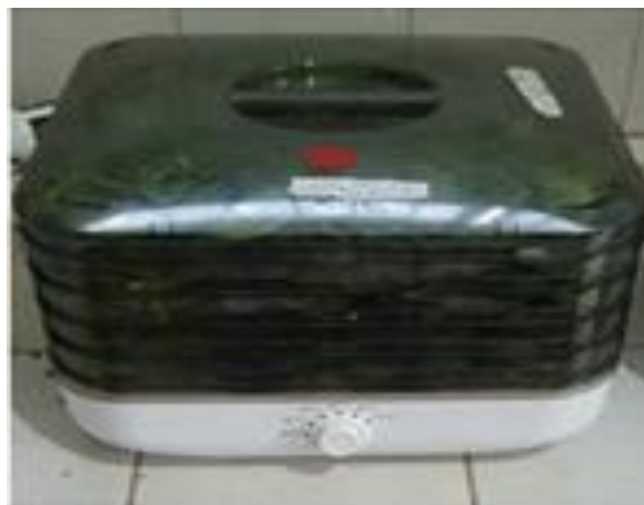
Fig. 2: Layout of the trays with P. amboinicus leaves loaded in the turbo dehydrator