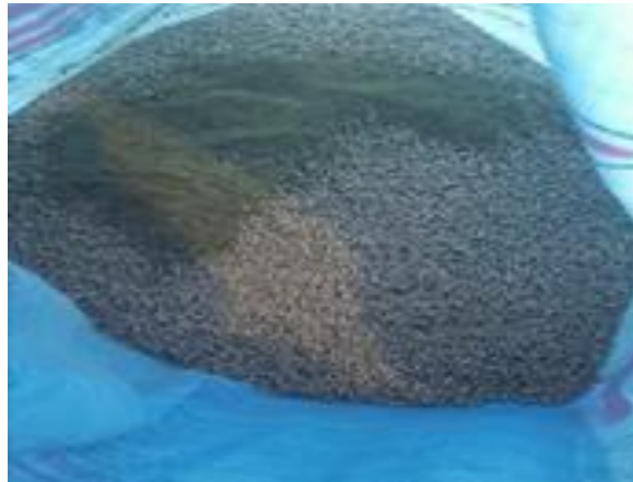
Fig. 1: Commercial feed with dehydrated P. amboinicus

discriminate between the means was the Bonferroni multiple comparison procedure to establish the possible existence of differences at a confidence level of 95%. The statistical program used was Stat graphics Centurion XVI .