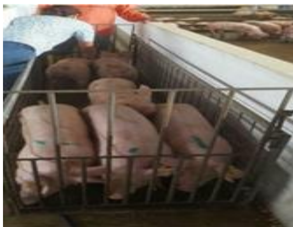
Fig. 3: Weighing the pigs in the fattening area