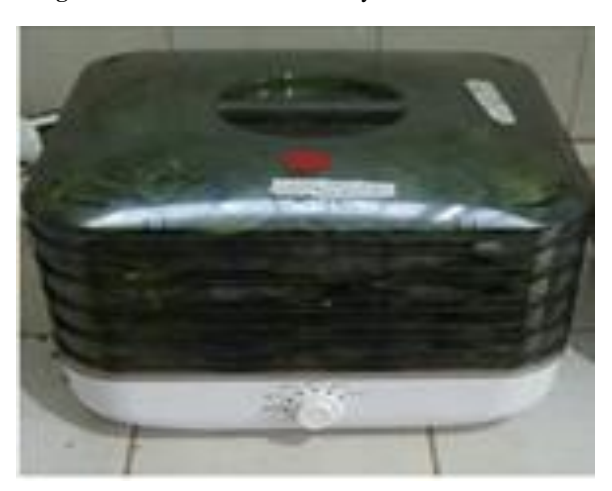
Fig. 2: Layout of the trays with P. amboinicus leaves loaded in the turbo dehydrator