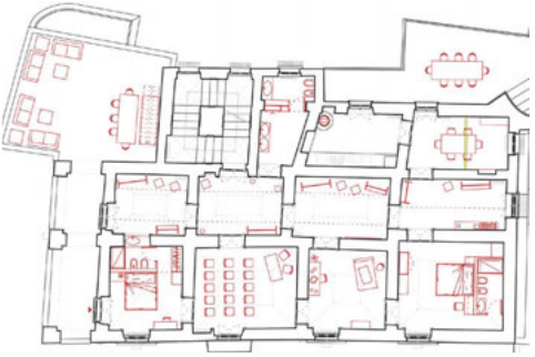
Fig. 13. The first floor plan converted into artist residency.

Following an in-depth analysis of the spatial and material features of the building and of the