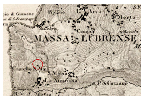
Fig. 3. Reale Officio Topografico, Carta topografica e idrografica dei contorni di Napoli, 1817-19.

centuries. The walls were gradually incorporated into the building fabric, and the citadel became a quiet hilltop village, which still appears today as