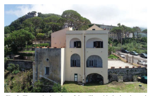
Fig. 2. The north elevation of the villa, with the loggias and the volume identified as the initial nucleus of the building (photo by drone, 6/6/2020).

The highlighted features are also found in Villa Murat. The growth by subsequent aggregation of volumes is evident: starting from an initial nucleus found in the volume facing north with the terrace above (fig. 2) - the building was enlarged, probably at first only on the ground floor, whose irregular plan and rustic character witnesses its origin. Later, the construction of the first floor, organized in rows of rooms, and of the loggias regularized the pre-existing building, making it a villa. The extrados vaults can be found both in the probable initial nucleus of the villa and on the roof, where they have been hidden, as it often happens, with a double pitched roof. The loggias facing the sea solve the greater difference in height and are placed on the side elevation, to avoid introspection.