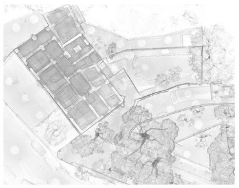
Fig. 8. Point cloud of the villa and its garden in the software Pointcab.

In order to obtain a single model from the two point clouds, GCP (Ground Control Point) have been used. They consisted of checkerboard targets and RAD (Ringed Automatically Detected) targets (Mat et al., 2014), which were visible from the aircraft and identifiable in the point cloud obtained with the laser scanner. The network of control points guaranteed topographical support to georeference the two models (photogrammetric and laser), so that the gaps in both clouds were compensated. The final configuration is the threedimensional model of the complex (Visintini et al., 2019), which consists of a system of visualization and interrogation of the spaces of the villa, with the possibility of remote measurement and exploration.