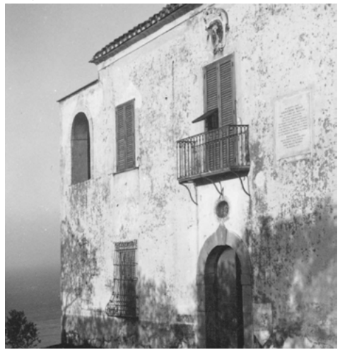
Fig. 5. The main façade of Villa Murat in 1939. The coat of arms of the Della Noce family was still visible.

Andrea Rossi owned also other buildings with an agricultural vocation, such as a rural house, another stable and two trappeti, in addition to the neighbouring cultivated land, confirming that even in the 19th century, agricultural and residential usage coexisted in the villa and in its surroundings.