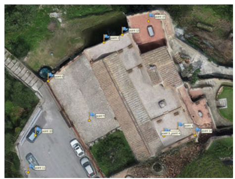
Fig. 7. Textured model of the villa in the software Agisoft Metashape, with the GCP used to link the two point clouds.

For the survey with laser instrumentation - aimed at acquiring the morphometric characteristics of the site and at defining the topology of parts of the complex that cannot be reached with other techniques the phase shift TLS (Terrestrial Laser Scanner) CAM2/Faro Focus3D X330 was used<sup>9</sup>. The survey of the building, both inside and outside, and of the garden required 169 scans.