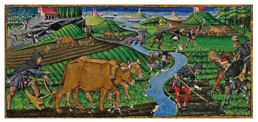
Fig. 8. Virgilio, Opere, (Riccardiano, 492) c.018r, Biblioteca Riccardiana, Firenze.