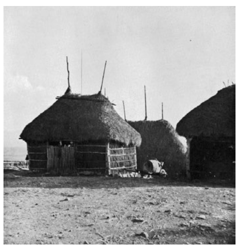
Fig. 1. Tuscan hut at 'Le Croci', Florence.

These same constructions were often immortalised in the works of artists, particularly painters and goldsmiths-sculptors.