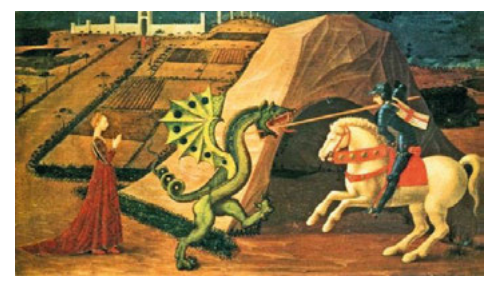
Fig. 3. Paolo Uccello, Saint George and the dragon (oil on canvas, 57 × 73 cm, about 1460, National Gallery of London).

the activities of the agricultural year on the spot, as well as being a place to spend the summer holiday (Cherubini & Francovich, 1973, p. 902).