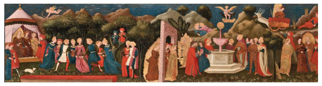
Fig. 13. Paolo Schiavo (Florence, 1397 - Pisa, 1478), An allegory of Love (Tempera on panel, 38.7×146.3 × 1.4 cm, around 1440, Yale University Art Gallery).