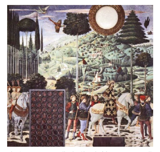
Fig. 4. Benozzo Gozzoli, The Chapel of the Magi - East wall (fresco, 1459-60, Palazzo Medici Riccardi in Florence).

In the works of late 14th and early 15th century artists, the extra-moenia territory in which these two worlds coexist is often depicted; in painting, the works of Domenico Veneziano (Venice, 1410 - Florence, 1461, Fig. 2) and Paolo Uccello (Pratovecchio, 1397 - Florence, 1475, Fig. 3), as well as those of Benozzo Gozzoli (Scandicci, 1420 - Pistoia, 1497, Fig. 4) are probably among the best known examples.