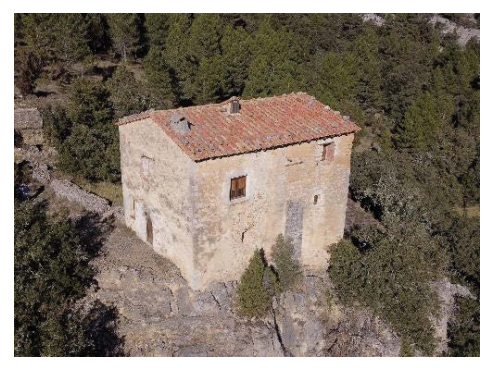
Fig. 5. Torre de Font d'en Torres, Morella