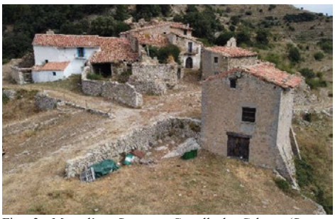
Fig. 3. Mas d'en Segures. Castell de Cabres

Houses were all jointly set along on a northeastsouthwest axis, supported on the terrain slope and aligned northwest. This dense configuration helps to ensure the maximum amount of solar radiation possible, as well as limits thermal transmission losses reducing the portion of the façade exposed. In fact, two of four houses had a small frontage width, and casa del Racioner is the widest. On other examples considered, such as Mas de la Carcellera or Torre Segura, dwelling buildings also follow this habitual organisation in which they face south and stay together to reach the maximum comfort conditions available. The use of topography in the design of vernacular architecture is likewise crucial and widespread in mountainous areas not only for protection from the elements - mainly wind and cold- but also for functional reasons.