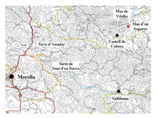
Fig. 1. Map of the settlements analysed.

structure determine how vernacular architecture develops in each region. Here, arid farmland where grain is almost the only crop viable, dry and windy climate and rugged orography have made settlement to be relatively remote. Distance is generally directly connected to relief and the chance of taming the mountains with terraces to take advantage of every piece of land. Where territory is not so harsh, houses can be a 20minute walk away, but this could be more than an hour where the terrain is rougher and the soil available to grow crops in is lacking. The above system is not exclusive to the region; it is present in the Valencian provinces' interior and vast areas of Catalonia and Aragón, with subtle differences related to each location's context if mountainous areas are compared. Construction's typologies on plains is not comparable to mountain mas . The former has been extensively investigated, especially in Catalonia's fertile regions based on the studies by J. Danés i Torràs (2010), but its conclusions are not broadly applicable to rugged areas.