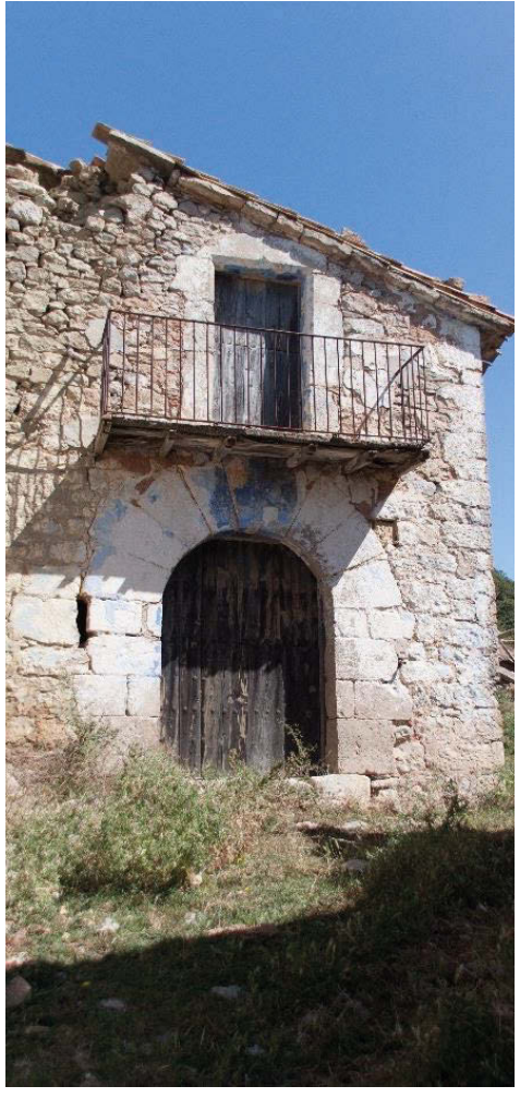
Fig. 07. Casa del Sord.

Els Ports Natual Park in Catalonia, contributing to landscape care that also includes its vernacular architecture. Thus, even if a significant proportion of these constructions are about to disappear or be reduced to ruins in the following years, a testimony of its historical, cultural, antiquity or sustainability values will remain.