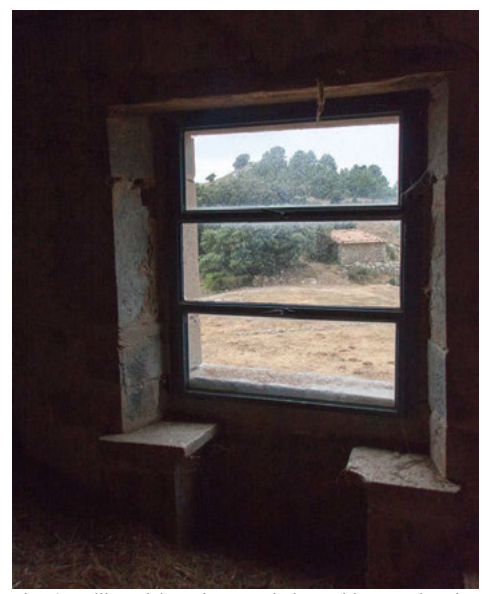
Fig. 4. Pallissa del Racioner. Window with stone benches

In the case of threshing floors, the difference of level was used to ease the storage works in barns, and because of that, it is usual to see them associated with a slope. These constructions, made for storing grain, and some pens are the only ones that are free-standing. However, a general pattern can not be established, as in other examples analysed, buildings are more compact or even complete one or two groups, as it happens on Mas de Vilalta.