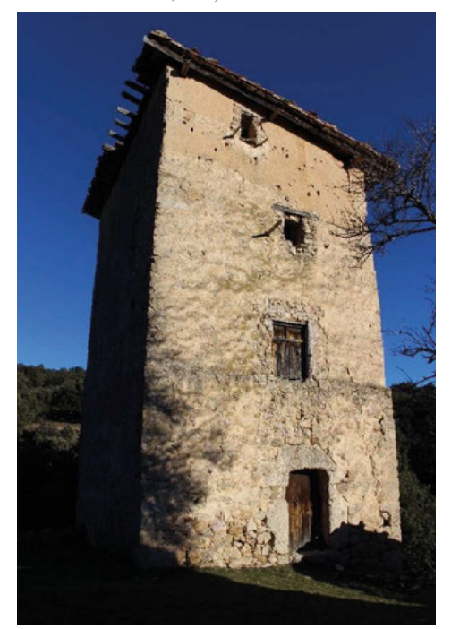
Fig. 6. Torre d'Amador, Morella

Torre d'Amador (or Torre Madó ) is an ensemble in Morella formed around a tower from the late 15th century or 16th. It resembled the type of tower in the area, or even on Teruel's Maestrazgo, although these usually had more defensive elements. This tower had been used historically as a storehouse for the tithe to guard it safely, but its look and construction techniques are rather more austere than the other two towers considered (Gamundí, 1991, p.