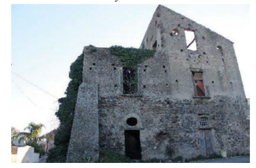
Fig. 4. Fortified house Fasano. View of the Western front with the two entries and the three windows.

up. Above the access room there is a frame in which an epigraph<sup>18</sup> attested the importance of these buildings in the framework of the productive organization of the nobility settled in the surroundings of Naples since the 17th century, with an increase of their presence in the Vesuvian area after the realizaof Royal Palace of Portici. tion the