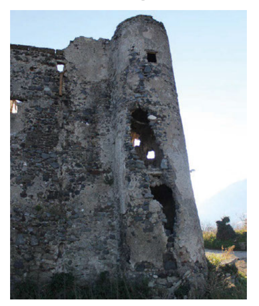
Fig. 8. Fortified house Casillo. Detail of the tower on the southern side. The wall structure is also visible here, with irregular stone elements of different shapes and the use of abundant mortar.

planking with the "panconcelli" or "chiancarelle"<sup>21</sup> with lime and volcanic inerts (Fig. 9). The covering structures, as we can see, have a double pitch, supported by wooden trusses of simple palladian type and with a mantle of brick tiles. Rare are the cases of vaulted roofs extrados in beaten lapillus<sup>22</sup>.