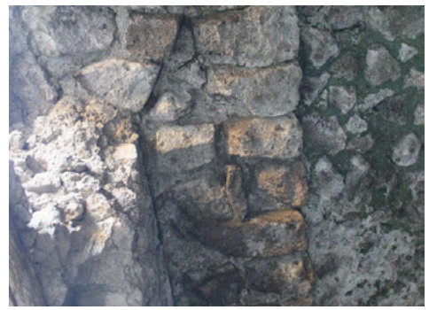
Fig. 7. Fortified house Fasano. Particular detail of the vaulting ceiling with mortar and small lava stone and arches in tuff ('spaccatelle') (Source: Ragosta, 2022).

The availability of volcanic material on site and the evident difference between the buildings in the valley and those in the mountains, the former reserved for a more comfortable stay, the latter almost as a support to the former in the agricultural and productive process, in line with a more sober morphology, is reflected in the wall fabric.