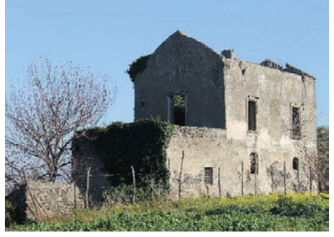
Fig. 6. View of the fortified house Scozio; we can note here the presence of a terrace facing cultivated fields

Finally, the fortified masseria Scozio (fig. 6), also with a rectangular plan, presents the entrance to the lower spaces on one of the two short sides, while the staircase, which leads to the upper floor with a large terrace, is grafted onto the northern facade. This is also surrounded by some small structures, among which one presents an interesting case of barrel-vaulted extrados coverage, hardly found along this side of Somma-Vesuvius. From the point of view of building techniques, the first remark that can be made is that in these three buildings there is almost no tuff, a stone which is widely used for the walls of the farms in the valley. The tuff is in fact used exclusively in the piers, in the setting of the windows and the arches of the vaulted rooms. The ribbed vaults are made of concretionary structure with small lava stone and mortar (Fig. 7).