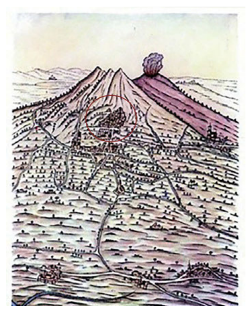
Fig. 1. Somma e contorni (XVII century, Archivio di Stato di Napoli). This view shows the Northern part of the volcanic site and the Monte Somma ridge with the scattering of buildings in the agricultural context. Study area circled in red.

features of their construction and their current criticalities, as part of a broader comparative study of the traditional rural constructions that have already been studied and fall within the same macro-area.