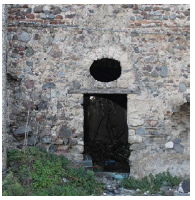
Fig. 5. Fortified house Fasano, detail of the access to ground floor: note the masonry construction 'a cantieri' and the flattening surface of the masonry section using brick elements.

The Casillo fortified house, which visibly respects from a distributive point of view the differentiation of functions between the ground floor and the upper floor, is still surrounded by a series of smaller rural buildings.