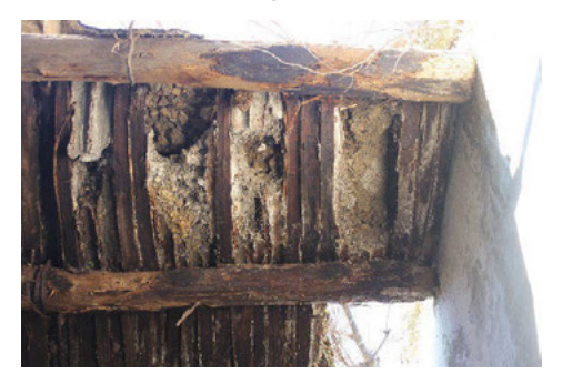
Fig. 9. Fortified house Casillo, Wooden ceiling with chestnut beams and second-arybeams ('chiancarelle') and flooring stratigraphy (Source: Ragosta, 2022).