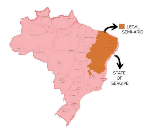
Fig. 1. Location of the Brazilian semiarid region and the state of Sergipe (Map prepared by the author, 2021).

Due to the limitations related to Covid-19 pandemic, it was necessary to perform a digital survey, in order to have an overview on buildings found in the study area and better direct field research. This survey was carried out using Google Street View (GSV) software, which consists of a virtual representation that allows for user to travel, as if in a vehicle, through available routes. Another software used was Street View Download 360 Pro which uses the API provided by Google to enable the acquisition of panoramic images available in a given region, ensuring files with higher resolution quality.