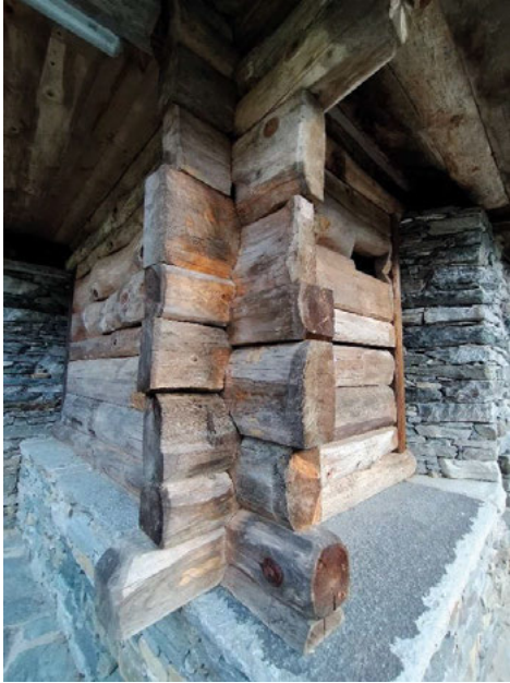
Fig. 4. Detail of the Blockbau technique at the House 2: half-log walls joined at the corners (Source: Di Paola).

the trunks were squared with large axes, sawn in half and planed on the inside to form a smooth wall while the dried moss was used to supplement the thermal insulation and to seal the joints (Fig. 4).