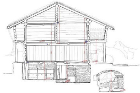
Fig. 3. Transversal section drawing of House 1. At lower floor, stables and the living room divided by a wooden partition; at first floor bedrooms; at the upper floor warehouses reachable by an external wooden (Drawing by Verona).

5.66x6.03 square meters and is 3.82 meters high).