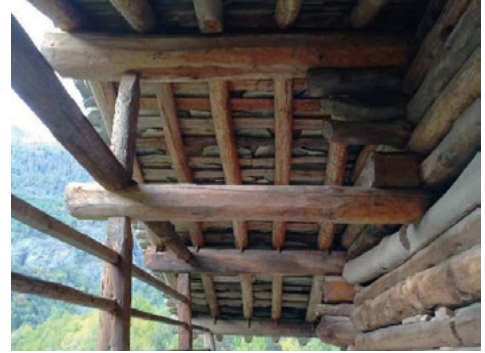
Fig. 5. Detail of the structure of the roof built with three frames, carrying stone slabs.

half-walls of interlocking trunks, wedged into the external walls, reinforce the structure between the ridge and the underlying chain beam. The two minor frames (perpendicular to each other) that carry the piode are placed on the main roof beams. The gutters themselves are made of wood, obtained from dug half-trunks of larch (Fig. 5).