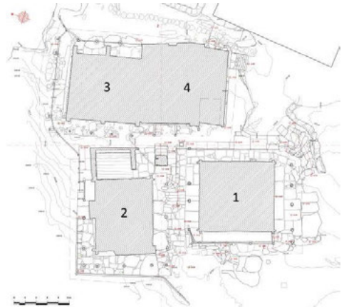
Fig. 2. Planimetric map with identification of Walser Houses surveyed (Drawing by Di Paola).

The monuments analyzed by us, whose safekeeping was taking over by the Superintendence from the Public Property in 1998, are the southernmost ones among those located into the area of Ronco Superiore. Coming from the valley, four Walser houses, built between the end of the XVI century and the beginning of the XVII century, are visible. The first two houses, almost perfectly-squared 7 , are called House 1 (the southernmost) and House 2 (the northernmost); behind these, House 3 and House 4 constitute a parallelepipedic structure (whose base measures 6x12 square meters): in fact, the block of House 3 and House 4 consists of two separate units with common external spaces and fronts 8 . Our work focused on the northern portion of such a block (i.e. House 3), as the southern portion (i.e. House 4) cannot be accessed, being a private property (Fig. 2).