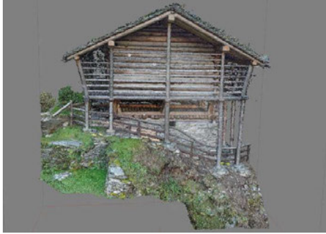
Fig. 7. Image of point cloud from photogrammetric survey (RGB view) of House 3.

integrated. We, then, exported two outputs: the point cloud and the orthophotos of the facades and roofs (Fig. 7).