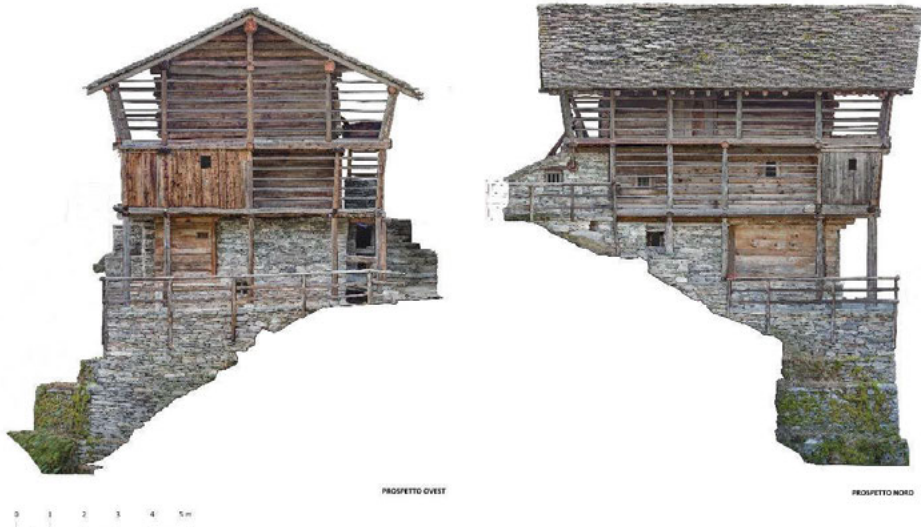
Fig. 8. Orthophotos of House 2 's facades (west and north) overlapping CAD drawing.

This project confirms the great potential of point clouds in the managing activities concerning the cultural heritage. Point clouds can be used for