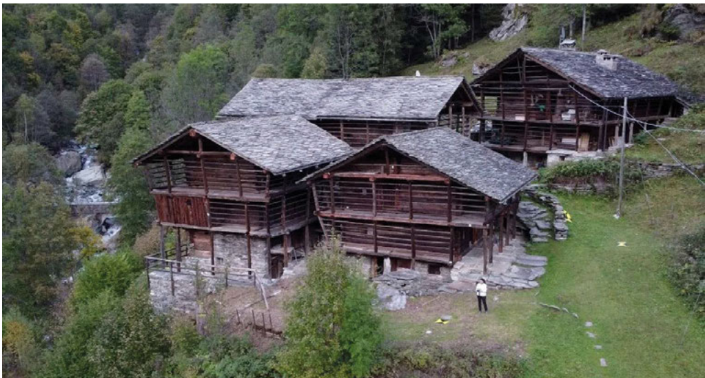
Fig. 1. Aerial view of the three Walser Houses shot by drone (Source: Frosini).

The Walser architecture characterizes several areas of the Italian region of Piemonte. The name derives from that of the Walser population, who migrated to Italy from the Swiss Canton of Valais 4 (in German Wallis ), located nearby the Monte Rosa mountain massif. The Walser population, first, settled in semi-nomadic conditions; subsequently, created stable settlements, while maintaining the original