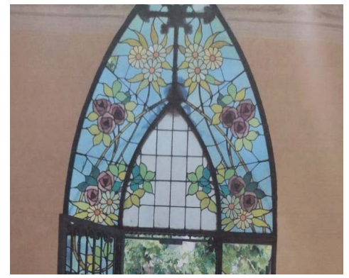
Fig. 14. Restored stained glass window, gate, British cemetery, Valencia (Source: Benavent, 2017).

Once restored, the initial process was followed in reverse. The pieces were packed and returned to their original place. Then, it could be observed that they had recovered their transparency and original colour. In that way, they once again endowed the rooms that were illuminated with colour.