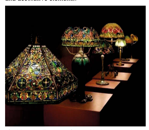
Fig. 16. Lamps.

traditional techniques. Stained glass can be painted or covered with lacquers or enamels. These small pieces of glass are cut into the form required by the design. They are joined principally by two types of technique. One is the traditional one, using a lead cord. Each piece is surrounded by one of these cords and joined to the following one. In this way the entire space is covered with the original design. This technique must be executed horizontally and produces plain stained glass to be assembled in the window. In the 19th century, Louis Comfort Tiffany discovered a technique to break with the traditional one. This technique is known as the Tiffany technique. The main difference is the use of copper as a support material. It is used to join the glass pieces. This material is light and malleable so the pieces can be joined with great versatility. This offers more creative possibilities, such as curved stained glass or very small pieces of glass, allowing more detail. This technique allowed stained glass to evolve from a purely architectural feature to jewellery and decorative elements.