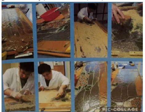
Fig. 13. Restoration process (Source: Benavent, 2017).