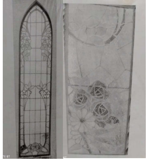
Fig. 10. Cardboard drawings. Chapel window. British Cemetery. Valencia.

In those parts with broken glass or where cord was damaged, the lead was removed to allow proper cleaning of glass and replacement of broken panes. The panes of glass that had been replaced in the previous restorations were replaced by glass in original colours. As an example, the daisies, incorrectly glazed with white glass, had their original vellow glass restored. Once the glass was prepared, it was welded. Following the restoration criterion that was to preserve the original glass to the maximum, the new weld beads were made with tin, following the Tiffany technique so that the restored parts were differentiated from the originals. Finally the beads were restored and cleaned. The original state was reconditioned after removing twothirds of the stained glass to give consistency.