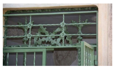
Fig. 3. Detail from the chapel door. British Cemetery, Valencia.

Stained glass windows were located in this frame. They occupied an area of 1.7024 m<sup>2</sup>. These consisted of three panels, two on the sides and one on the top, in which floral motifs were reflected. All three form a plant network in which daisies are located, a characteristic feature of the whole