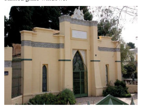
Fig. 1. Façade. British Cemetery, Valencia.

composed of a central door that gives access to the entrance portico and two side windows. One of them corresponds to the chapel; however, the other has no use since it leads directly to the interior of the cemetery without corresponding to any specific space. Despite this display of ingenuity at the compositional level, the construction's greatest value was its stained glass windows. They were made using the leaded technique, just like their Gothic predecessors. During the decline industrialization and the civil war, the British cemetery fell into disrepair with its consequent degradation. Due to the situation of extreme abandonment that this construction suffered, the British Cemeteries Foundation in Spain decided to proceed with the recovery of this historic enclave. It was not simple, since apart from the cleaning of the cemetery and the restoration of the tombs and the facade, the need for restoration of the stained glass windows was vital. As has happened over time, traditional artisanal techniques have been lost, making it difficult to preserve some elements of our heritage. In 2017, through Consorcio de Gestión del Centro de Artesanía de la Comunidad Valenciana (Valencian Community Handicraft Centre), Fet de Vidre, an employment centre specialising in manual work on glass elements, was commissioned to catalogue and restore the stained glass windows.