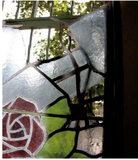
Fig. 4. Detail of the stained glass window on the chapel door. British Cemetery, Valencia.

Despite being located inside the cemetery, protected from vandalism, the stained glass windows showed cracks and the loss of part of their design. These panels displayed a serious deterioration of the lead, with around 10% missing. It also presented damage mainly through passage the of time (dirt, discolouration).