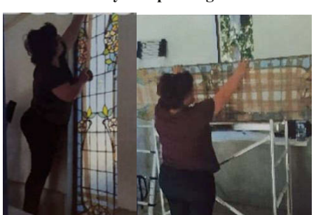
Fig. 8. Disassembly works. British Cemetery.

Once the four pieces were catalogued in terms of their shape, design, condition and damage suffered, they were prepared for disassembly. For this step, the loose parts were secured with non-aggressive adhesive tape. This step ensured that once they had been disassembled, an exact tracing of the stained glass could be made. It could then be returned to its original shape once the restoration work had been carried out.