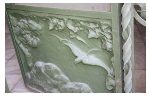
Fig. 2. Detail from the chapel door. British Cemetery, Valencia (Source: Burguete, 2017).

The chapel door was built with a forged steel frame which is a separate feature in itself. The door is decorated with metal bats and sculpted steel panels as bas-relief.