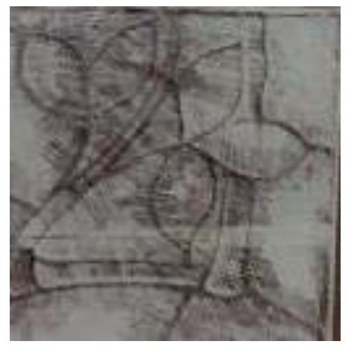
Fig. 9. Charcoal copy (Source: Benavent, 2017).

After dismantling, the pieces were placed horizontally on workshop tables. There, a lifesize copy of each window was made by copying with charcoal on onion paper to guarantee the correct restitution of the parts that had to be disassembled.