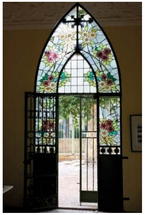
Fig. 6. Cemetery gate. British Cemetery, Valencia.

window is 2.6 m<sup>2</sup>. Its structure meant that the lower glass pieces supported a great weight due to their dimensions. This caused the lead that held the pieces to lose its consistency causing bulging and detachment of pieces over the years.