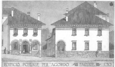
Fig. 2. The Post office in Agordo, Drawings of the Front and Side view. A. Alpago Novello, 1919 (Zanella 2002, p. 60)

Alpago Novello's part in the reconstruction program for damaged churches was a circumstance perhaps favored by his relations (Zanella 2002, p. 31). Surely it was also an opportunity to study the local features and context and surveys before shaping the project, as he did in Agordo, near Belluno (fig. 2). Designing the new post office of this small town he arranged the central square which had been gutted when the old St. Peter church had been demolished, thus creating 'ambience'.