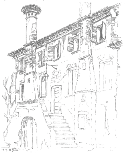
Fig. 1. XVII century house in Montebelluna. Drawn by L. Angelini, dated, 28 January 1919. (Annoni 1920, p. 77)

they were standardized and serial. He was afraid of the practice "capace" but "rapace", that sounds like speedy but greedy, of construction companies. He promoted builders' organizations to preserve their know-how and the use of local materials. Blaming school systems and the professional world, he was hoping for the rebirth of local trade schools (such as that of the woodartisans in Brianza). He therefore approved the collection of "peasant and regional art objects" as a means of protecting the products of slow experience, gathered throughout centuries and families. He recalled his masters Luigi Conconi (1852-1917) and Giuseppe Sommaruga (1867-1917), Alessandro Mazzucotelli (1865-1938) and Giovanni Buffa (1871-1954). He professed he was one of their pupils (like Mazzucotelli, Giovanni Beltrami, Enrico Monti and Gaetano Moretti) at the 'Società Umanitaria' in Milan. While the works of Buffa and Castiglioni were sliding, he pointed out the designs by two young architects, Luigi Maria Caneva and Luigi Angelini: snapshots of damaged or endangered village houses (fig. 1).