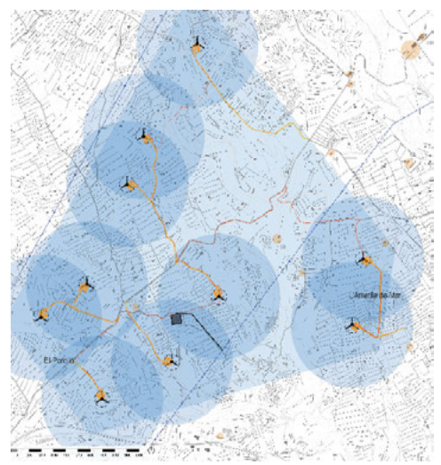
Fig. 8. Superposition of the wind farm project over the rural landscape

attention to the layout of the territory, its history, nor its inhabitants. If this project, like others in our country, goes ahead, it will turn a rural landscape, community and human-scale built area into a noisy, private and industrial estate, made for machines, and possibly deserted, empty of people. In short, we are facing the destruction of a historical heritage site and, with it, part of our memory, our collective imagination and our identity.