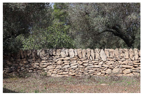
Fig. 3. Dry-stone wall

They are built using simple practices of loading and bonding, without cues de sargantana (lizard tails), that use all formats of stone. The role of the reble, or infill, is fundamental, often carried out by children and women, and consists of introducing small stones mixed with gravel, sand and mud into the centre-rear and upper part of the wall, which, due to friction and solidification, helps to strengthen it. Crowning the wall with a rastell, large stones placed on edge from side to side of the wall, with variable depths for better bonding, is specific to this area.