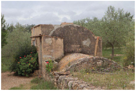
Fig. 6. A cistern covered by ceramic vault

There are also separate cisterns on the plot, the cocós or aljubs, used to supply water for livestock. They were situated according to natural hollows in the rocky crust, or wells were dug to collect runoff water. They are enclosed with walls and vaulted ceilings or corbel vaults. An earthenware jug was left to offer water to passers-by.