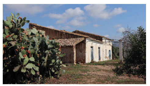
Fig. 4. Mas del Metge, El Perelló

The mas is the small, permanently inhabited farmhouse. It takes the name of the place, or the owner's name or nickname: Mas Pons, Mas del Metge, Cal Català, Mas de Molinos, El Bon Mosso, El Ventero or La Peixo. The central volume, facing south, has one or two floors, with an Arabic-tiled shed or ridge roof and doors made of painted wooden boards, surrounded by auxiliary buildings: sties and farrowing pens, haylofts, workers' homes, circular threshing floors, porches or shelters, cisterns and bread ovens. Masia Pons is an exception in this area for its size and importance, a vestige of an old farmstead that stands beside the N-340 road.