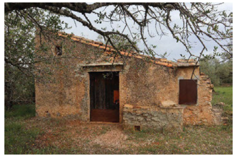
Fig. 5. Caseta del tros

In the space in front of the house there is an olive or carob tree at a short distance, with a low circular wall that contains the roots. This marks out a protected domestic space which the family uses to celebrate, rest and eat, "as is the tradition, a house for working, celebrating and meeting" (GenCat, 2014).