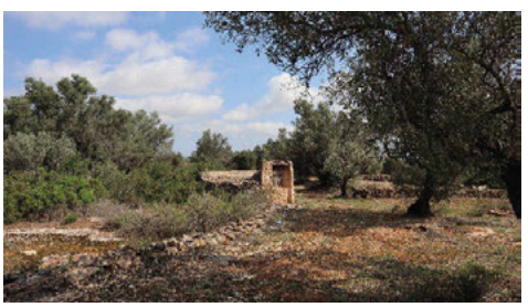
Fig. 7. An aljub made by dry-stone walls and vault

This area, beyond La Figuera de l'Hora, or the One-hour Fig Tree (the time needed to get to the town of El Perelló), has few huts compared to the large number of casetes it has.