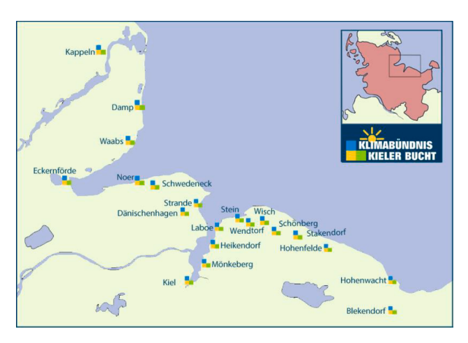
Fig. 3. Map of Kiel Hub with the town of Eckernförde.

of crops and vegetables for local consumption and food sovereignty. Recent national policy (Loi d'Avenir on Agriculture and Food: 2014, and the strategic plan for the agro-ecological transition in Guadeloupe carried by the Territorial Collectively and acted upon in November 2020) is supporting diversification towards multifunctional agriculture, focusing on small-scale family farming as a possible vector for agricultural development in light of the challenges of the 21st century, such as adaptation to climate change, food sovereignty, agro-ecological and bio-economic transition. In addition, grass root initiatives promoting small-scale farming/urban gardening are currently spreading over the islands. This could open up new, fairer opportunities for agricultural production and consumption for the Creole and non-Creole population in the French West Indies under the changes new climate regime dictating to seasonality, timing and volume of rainfall.