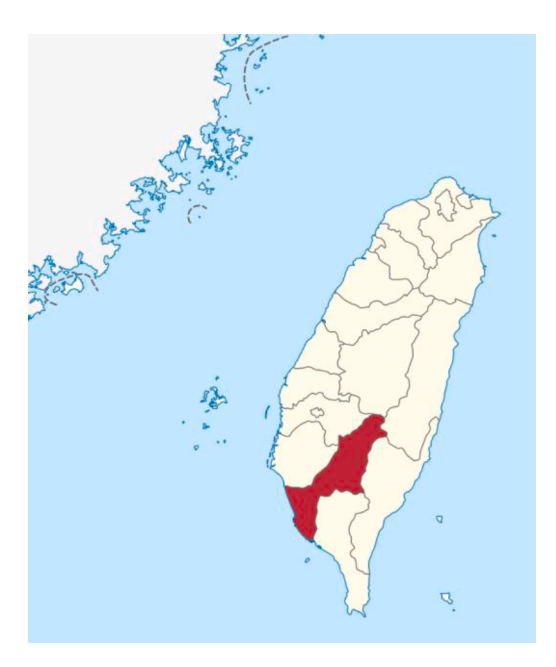
Fig. 6. Map of Kaohsiung.