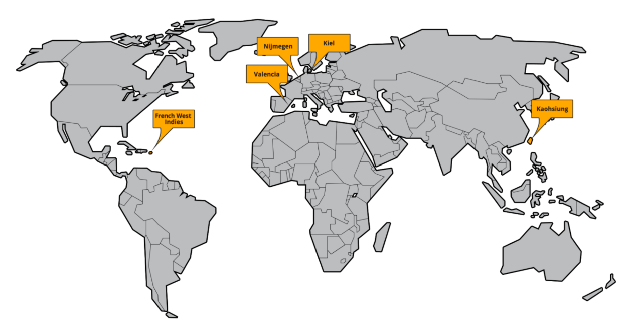
Fig. 1. Location of Hubs.

The Valencia Region is located in a territory very vulnerable to climate change. Some of the main risks associated with climate change are general increase in temperatures, decrease in rainfall, aridification of the territory, rise in sea-level, emergence of new invasive species and new diseases and increased intensity of extreme events like heat waves and droughts (GVA, 2018). Sea-level raise and marine intrusion to the La Plana de València aquifer are also perceived as risks for agriculture located in the coast. The quality of the raw water is also affected by