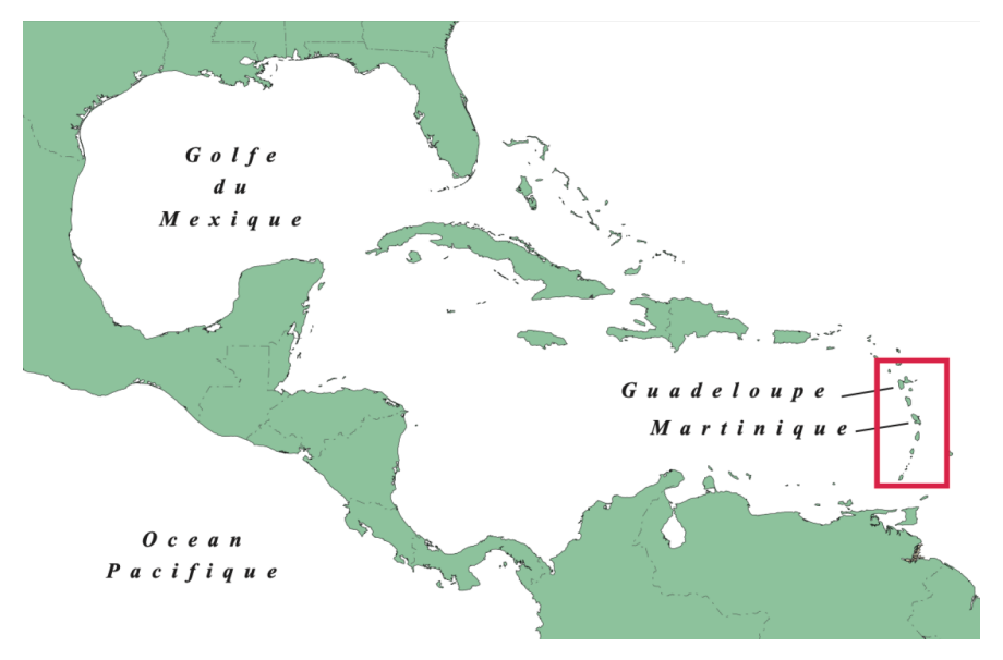
Fig. 5. Map of FWI.

The crucial role which state and public administration plays in all cases is evident although the extent to which administrations are taking actions seems to depend on a variety of factors. In the case of the