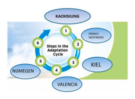
Fig. 7. Five-hubs-in-adaptation-cycle-diagram.