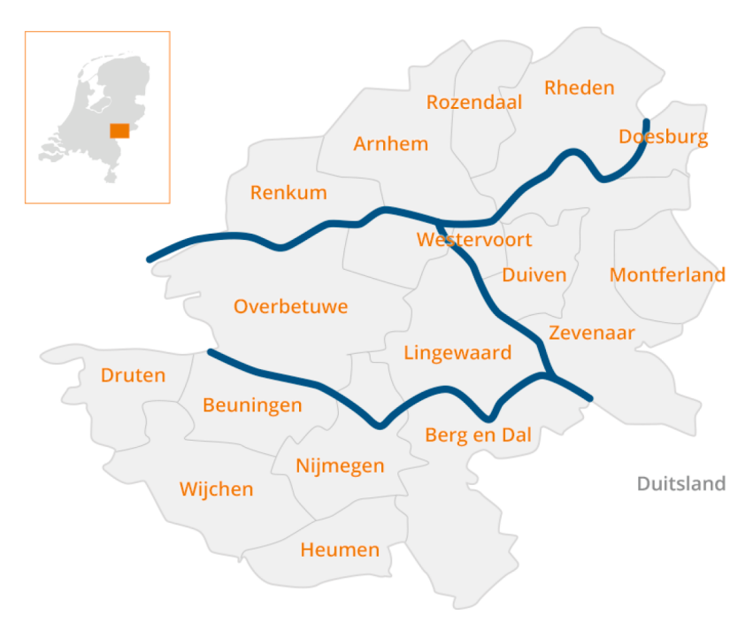
Fig. 2. Map of Nijmegen and its regional area.