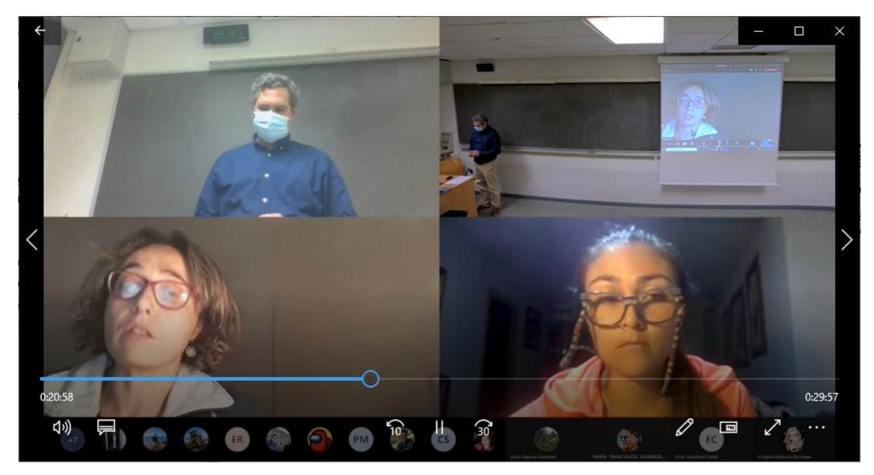
Figure 2. Online debate.