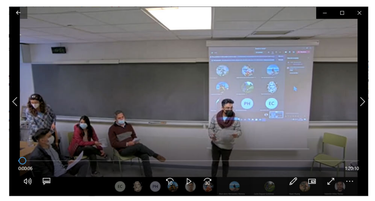
Figure 3. Face-to-face debate.