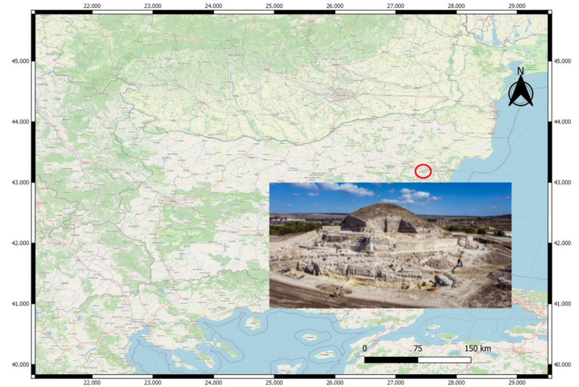
Figure 1. Location of the studied archaeological site.

It needs to be pointed out that those data are the main source for the new Copernicus Pan-European product - European Ground Motion Service (EGMS, 2021) - which is under its pilot phase to provide information concerning the ground motions at continental level. In order to increase the reliability of the produced results SAR data from both types of orbits of the satellite – ascending and descending – were considered in order to eliminate the effects of the topography in the researched region. Other factor that is increasing the accuracy of the final results about the surface motions is the well maintained orbital position. It needs to be mentioned that the processed SAR data sets were delivered by two identical satellites thus shortening the time resolution and increasing the number of images that could be selected to form single interferometric pair.