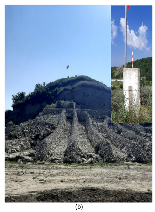
Figure 2. The geodynamic network for the area of the Mirovo salt deposit - general scheme (a) (Valev et. al. , 2015) and single measurement point at the Solnitsata site (b).