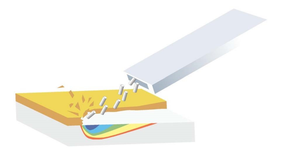
Figure 1. Action of dry ice blasting on the undesired layer. Descriptive diagram of the removal of unwanted layers (yellow) while keeping the underlying matrix intact (gray). The impact of pellets is depicted next to the gradual alteration of surface temperature.

The impact of the projectile on the deposit to be removed produces a regional decrease in the surface temperature, triggering alterations in the mechanical properties of the deposit. As a result of the thermal shock, the elasticity of the layer is reduced, making it less resistant and, consequently, more friable. At the same time, a macroscopically visible network of cracks is generated as a result of the shrinkage of the material, evidencing the different expansion coefficients of the layer. This results in a weakening of the forces that bind it to the matrix, causing its detachment (Figure 1) [19].