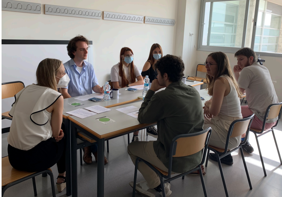
Figure 5. Development of the focus group.

decisive: “the moderator must very effectively manage the time allocated to each question, each sub-topic of the focus group since there is a danger of reaching the end of time without having been able to go through all the points of inquiry”. For this reason, it is very important that before starting the group moderation, the times that each part of the inquiry requires are established. As the questions are asked, the moderator will control how much time is left for that part of the focus group, having to move on to the next one once the time has elapsed” [8].