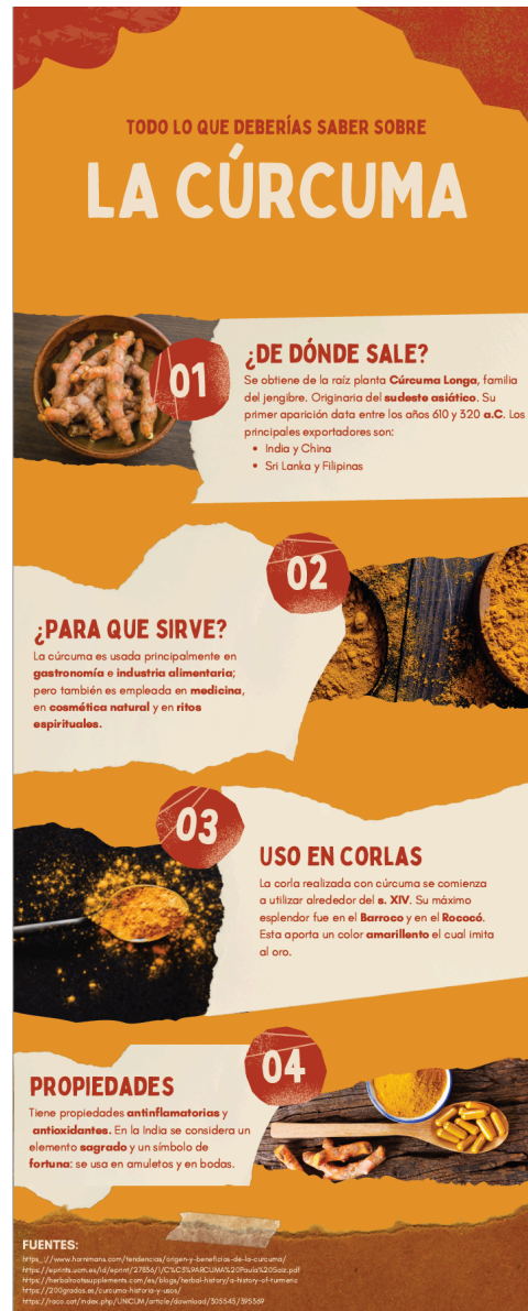
Figure 2. Group infographics.

In the last year, teaching innovation has been evaluated, and several data collection tools have been selected to analyze the evolution and possible improvements of the project. The results have been collected by the teachers who participate in the project, and by colleagues who have not participated in the project but have followed its evolution and the conclusions of the students. One of the tools used has been the focus group, to collect and analyze the teaching experience of the students.