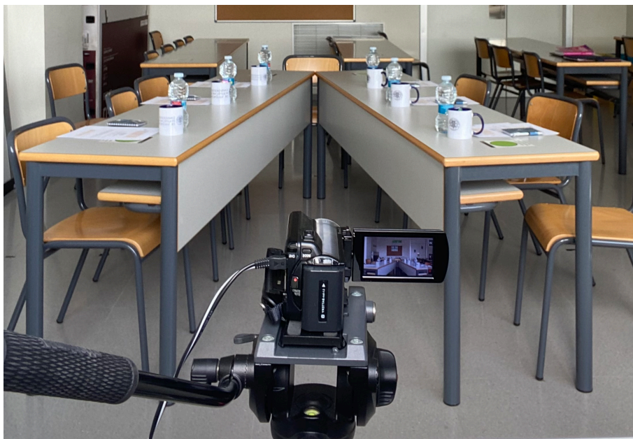
Figure 4. Focus group space.

“The choice of the place is also important: it must be a space away from the noise so that the members do not lose concentration and understand the questions that the moderator asks. The place must be known by the members and be equipped with the appropriate furniture” [7]. It was developed in a classroom in the Faculty of Fine Arts building (Figure 4), in which students usually have classes throughout the course. It is a space known to them, it is familiar. Two tables were placed so that they could have visual contact between all the participants in an equitable manner.