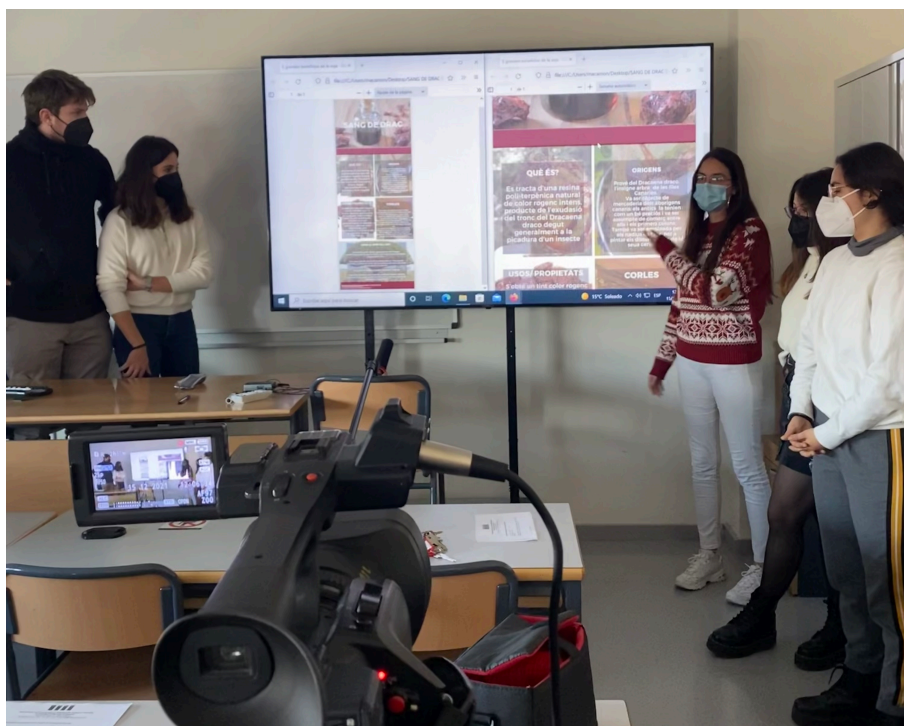
Figure 3. Exhibition of group infographics.

The individual infographics are made from the practices and topics already covered in class. The shared group infographic responds to an investigation proposed by the teacher, which they have to do collaboratively, and then capture it in a collective infographic and deliver a presentation in the classroom, in which the entire group has to speak (Figure 3).