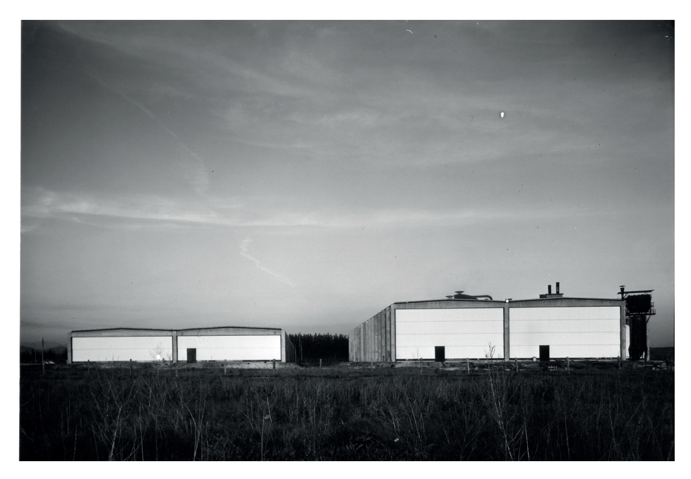
Figure 4 | Siag Factory, Marcianise, Caserta, 1962-64. Architect Angelo Mangiarotti, engineer Aldo Favini. View of the factory.

The construction of the modern factory. The introduction of prefabrication in Terra di Lavoro \mathit{Castan}\delta