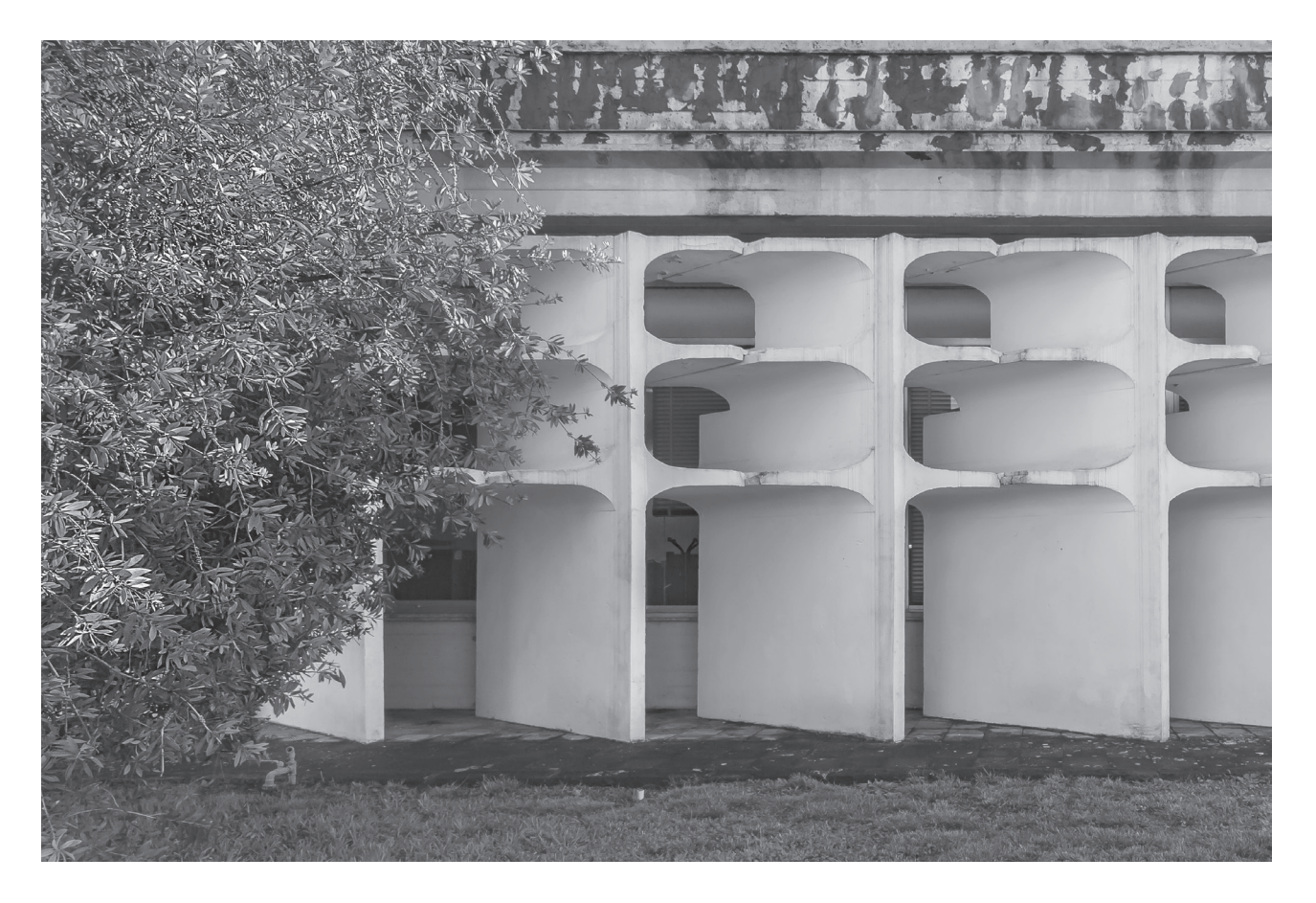
Figure 11 | Kodak Factory, Marcianise, Caserta, 2020. Architect Gigi Ghò, engineer Aldo Favini.

The construction of the modern factory. The introduction of prefabrication in Terra di Lavoro \mathit{Castan}\delta