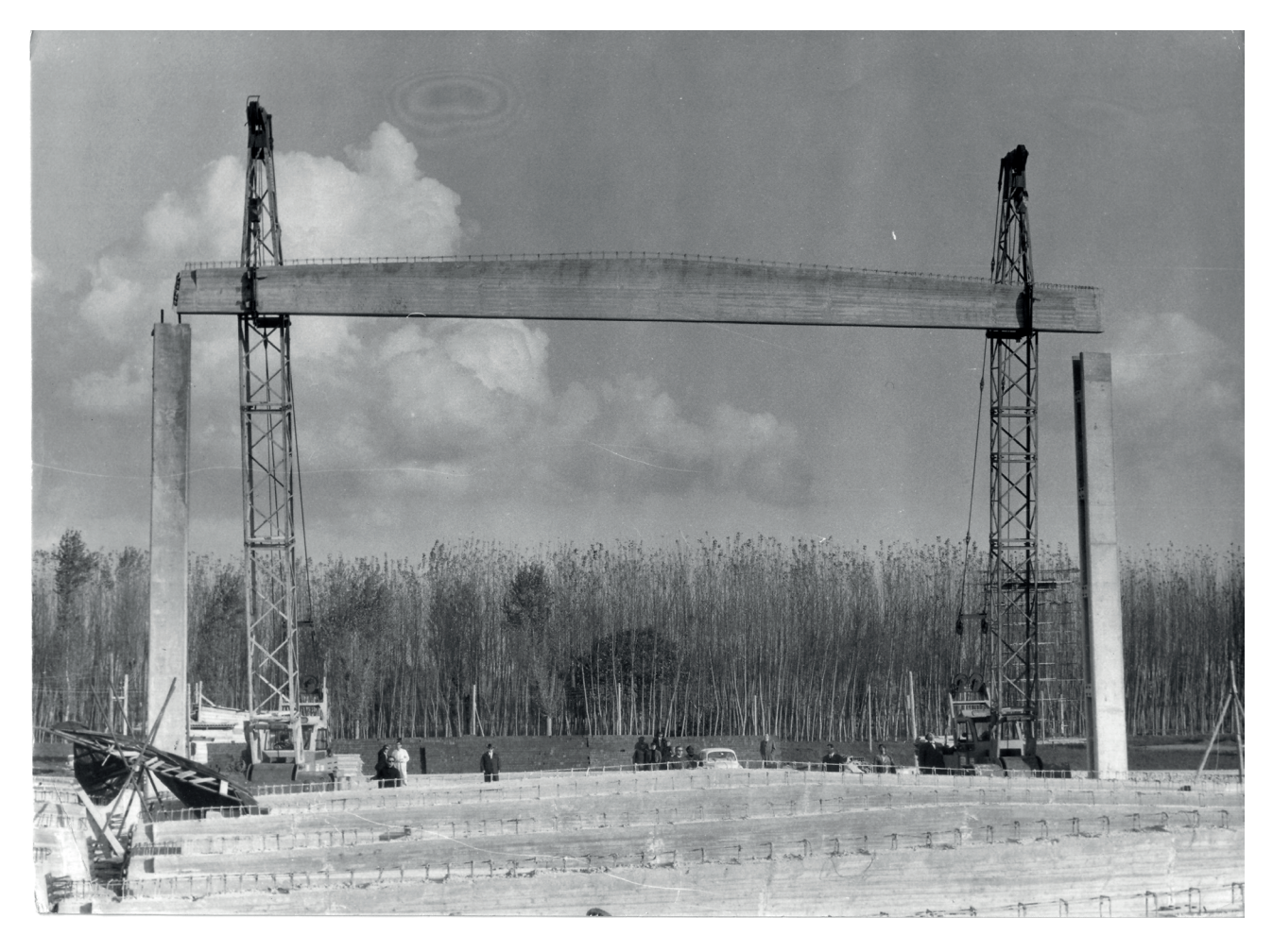
Figure 5 | Siag Factory, Marcianise, Caserta, 1962-64. Architect Angelo Mangiarotti, engineer Aldo Favini. The prefabricated system of the factory

The main residency and services body is divided in warehouses and production compartments. The outgoing 186 cm long and 240 cm tall, prefabricated panel is used here only in the opaque version.