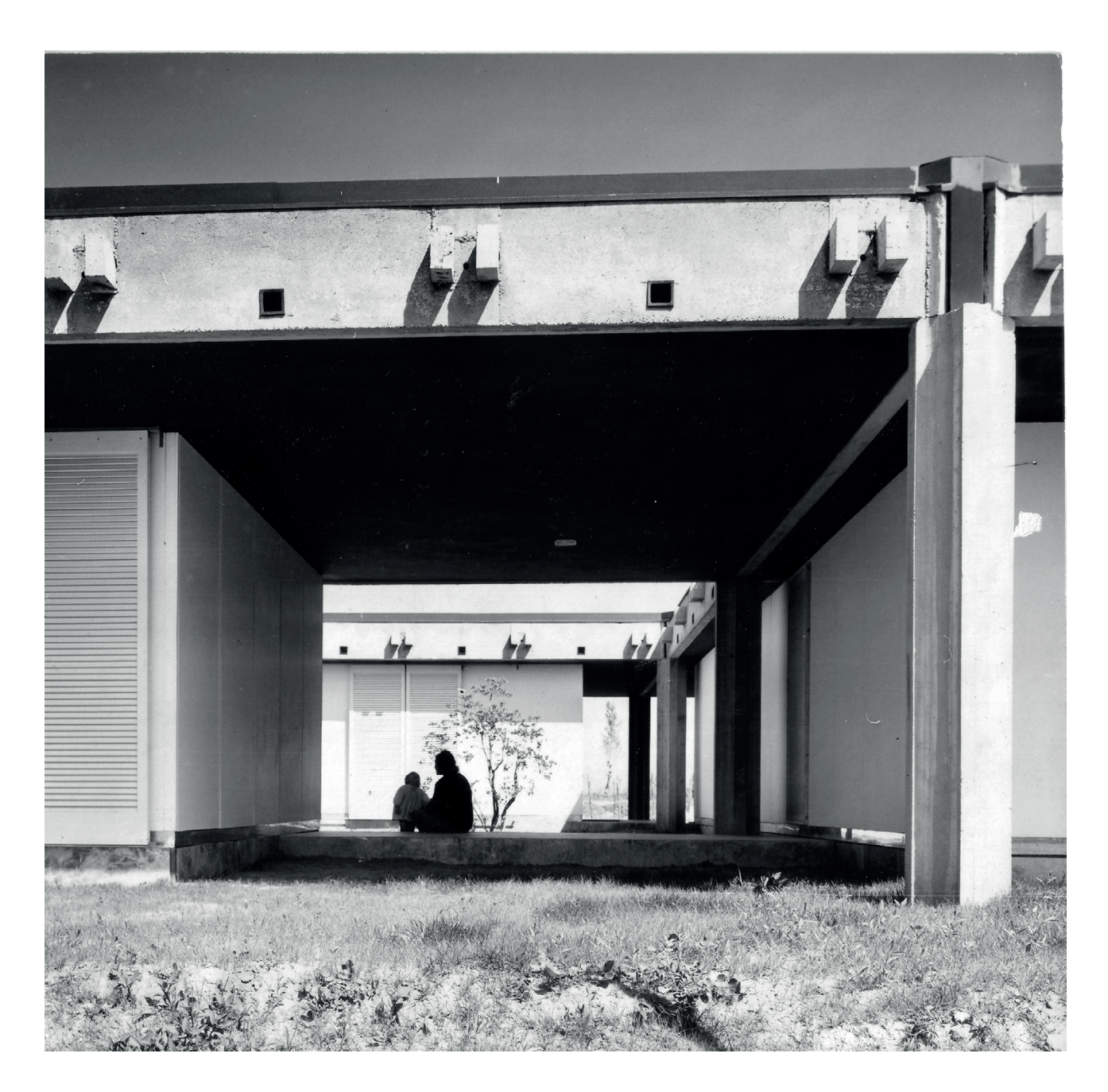
Figure 6 | Siag Factory, Marcianise, Caserta, 1962-64. Architect Angelo Mangiarotti, engineer Aldo Favini. View of the housing and services area

VITRUVIO 8 | Special Issue 2 (2023) International Journal of Architecture Technology and Sustainability