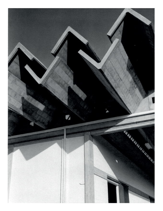
Figure 3 | Manifattura Ceramica Pozzi Factory, Sparanise, Caserta, 1960-64. Architects Luigi Figini & Gino Pollini. Detail of the prefabricated structural system of the paint compartment.

The complex is organized in two separate zones, on the model of the coeval Olivettian architecture: one intended as the employees' lodgings, offices, and services and the other aimed to the production warehouses. Bending the most up-to-date constructive techniques to the local language, to the natural vocation of the site and to the climatic habits, he conceives an anonymous architecture which is strongly integrated with the landscape (Fig. 4).