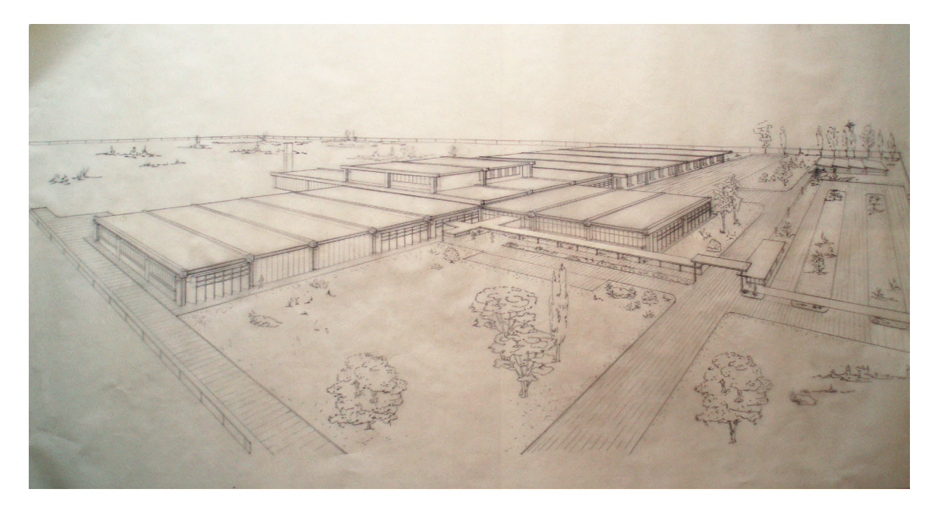
Figure 9 | Kodak Factory, Marcianise, Caserta, 1972-75. Architect Gigi Ghò, engineer Aldo Favini. Perspective view of the plant. (Gigi Ghò digital Archive - https://www.archiviogigigho.com/stabilimento_kodak_marcianise.html).