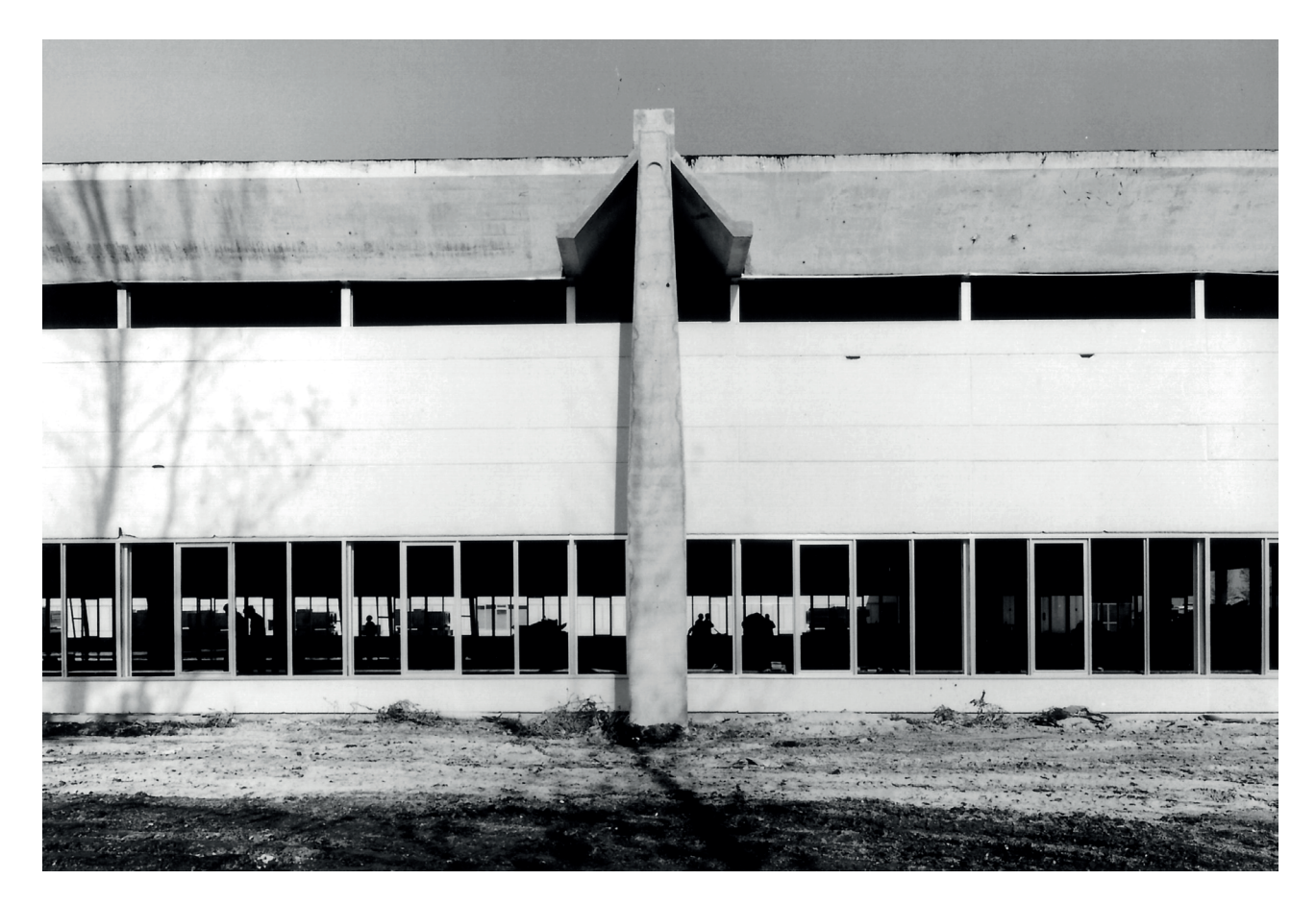
Figure 7 | Olivetti Factory, Marcianise, Caserta, 1968-70. Architects Marco Zanuso & Eduardo Vittoria, engineer Antonio Migliasso. South view of the production sector.