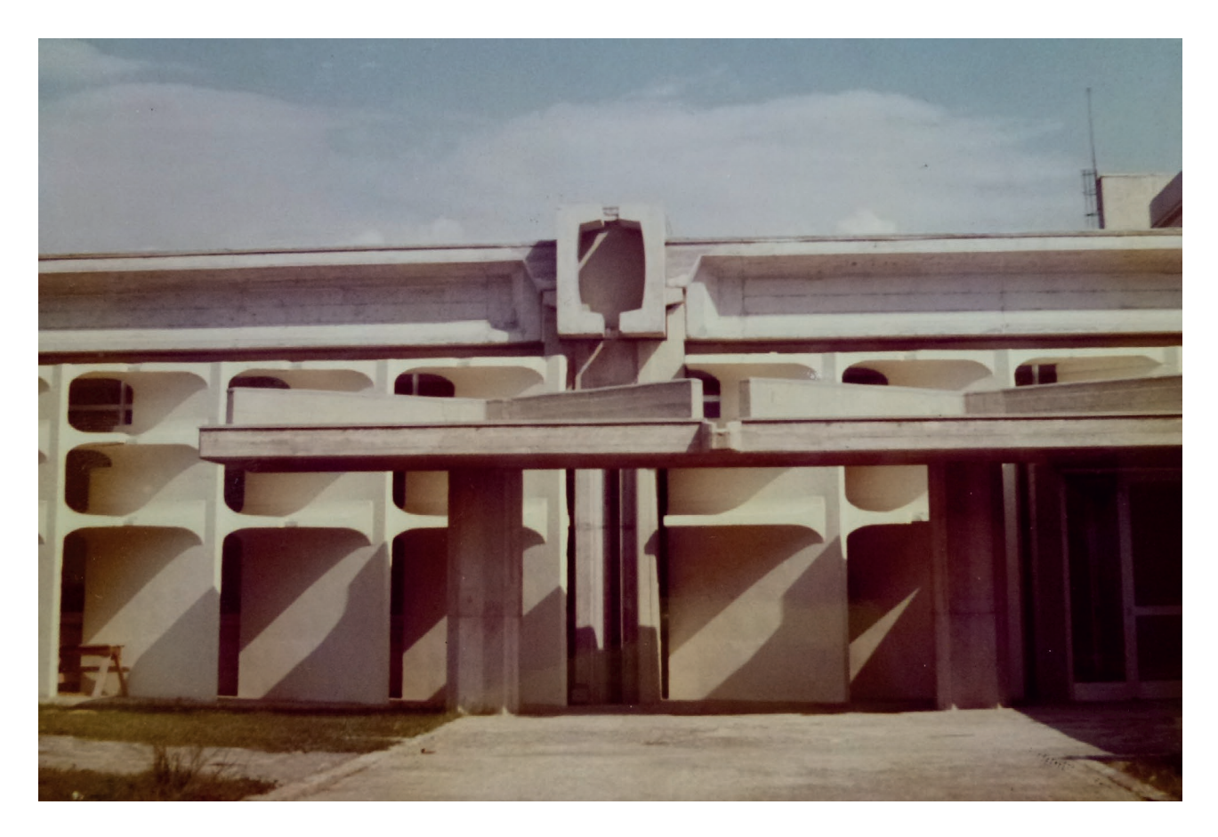
Figure 10 | Kodak Factory, Marcianise, Caserta, 1975 ca. Architect Gigi Ghò, engineer Aldo Favini. Photo of the pillar-beam system.

Figure 9 | Kodak Factory, Marcianise, Caserta, 1972-75. Architect Gigi Ghò, engineer Aldo Favini. Perspective view of the plant.