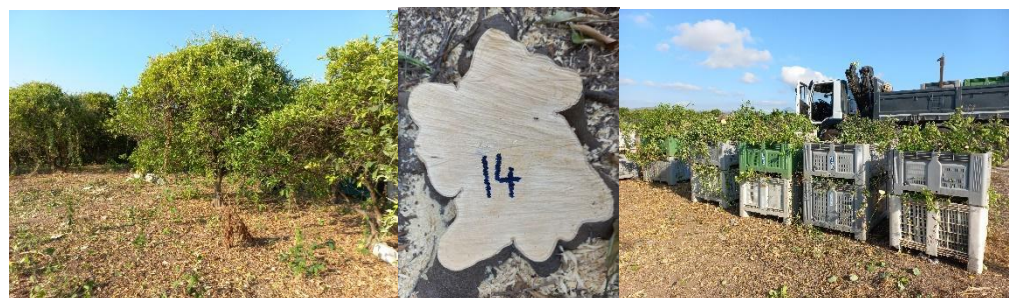
Figure 1. Measuring, cutting down, and weighing process of trees.

After the geometric characterization of the tree, it was felled. This was performed with a chainsaw at about 10 cm from the ground. After felling, the trees were chopped up, and the residues of each tree were deposited on pallets. These were weighed using an industrial scale. The area of the residual stump on the ground was also measured (Figure 1).