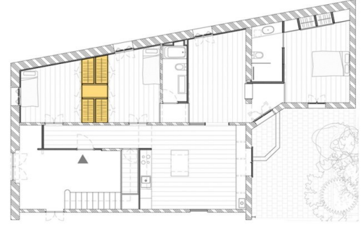
Figure 5. Cupboards and wardrobe, 1966.