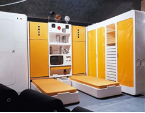
Figure 2. The Total Furnishing Unit.

The differentiated units can be grouped or displaced to adapt to several kinds of surrounding spaces and opened or closed to display its several functions. While the kitchen and bathroom units serve only this one purpose, the day-and-night unit includes all living functions, from sleeping to eating, reading, receiving friends, and withdrawing privately to the inner closed space, allowing "the user to make his own statement about both privacy and communality" (Ambasz 1972, 21). The space within the units is intended to be "dynamic," and "it should be in a continual state of transformation" (MoMA, NY 1972, 172) thanks to the interaction between the user and the units. This interaction shapes the space around the units and allows it to function by extending or hiding the beds or by displaying the cupboard to obtain a new privacy layer.