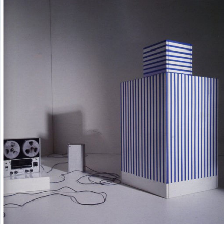
Figure 5. Cupboards and wardrobe, 1966.