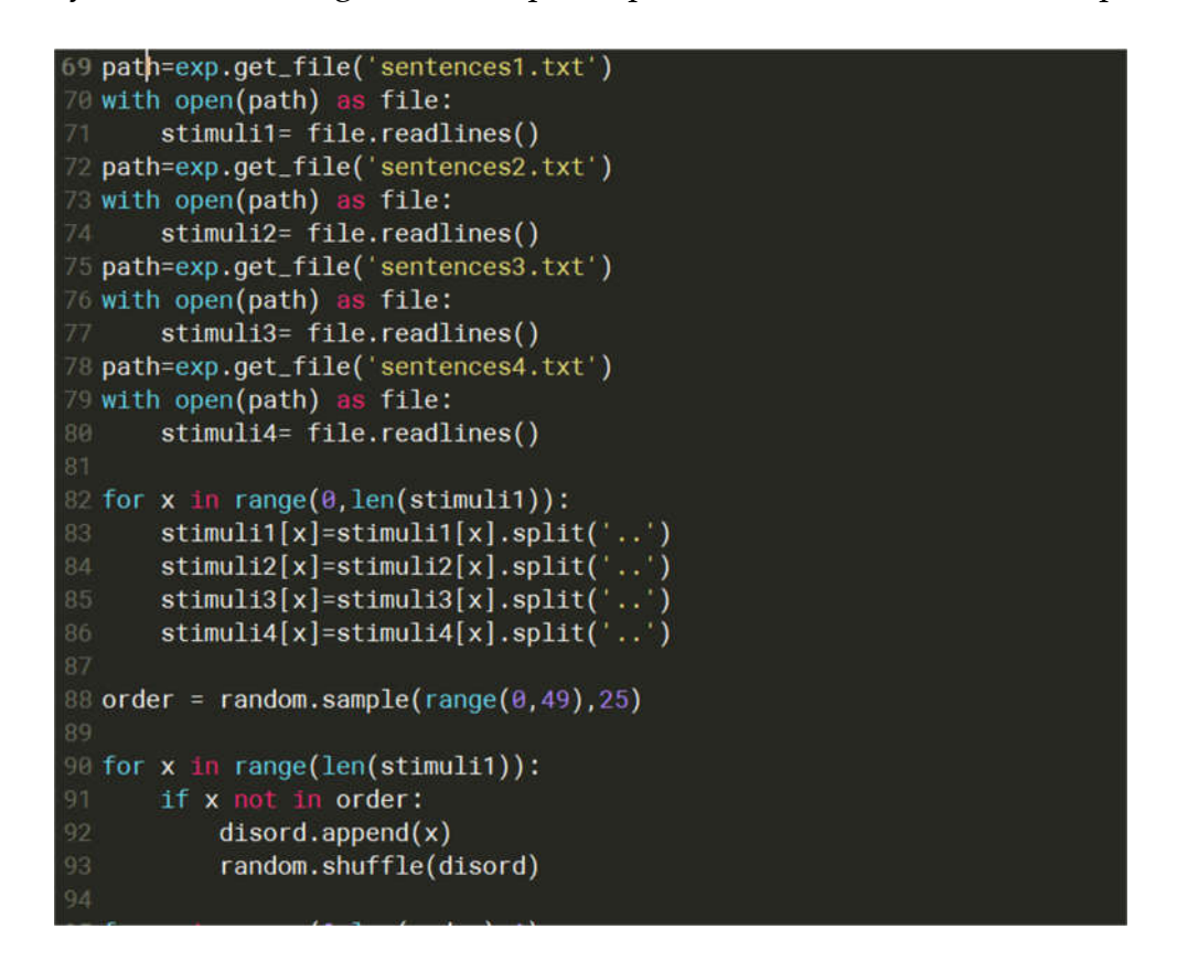
FIGURE 2. RANDOMIZING SEQUENCE

participants are required to type their answers in a box after being presented with a sentence, and they get visual feedback response of green (correct) or red (incorrect), while their accuracy is automatically calculated and given to the participant at the end of the test in a percentile.