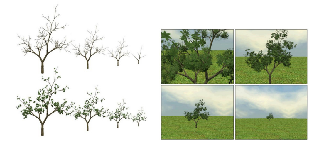
Figure 4: (a)A tree model rendered at different distances using different LODs: top, without leaves and bottom, with leaves. (b)Different LODs of a tree model in a landscape.

In Figure 4(b) we show different LODs of the same tree. In the upper left image the individual leaves near the viewer are represented by one polygon. The other leaves of the tree are rendered using the pre-calculated images. Figure 3(b) shows a scene we used to time a walkthrough. The resulting frame rates are summarized in Table 1. The tree model contains 2047 branches, 4085 leaves, and 10409 polygons. The reader is referred to [30] for different animations that show the performance of our system.