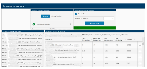
Figure 2. Ghostwriting detecting application at work.