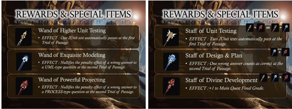
Figure 3. Rewards and Special Items: Wands (on the left); Staffs (on the right).

of passage (Figure 3a). Moreover, adventurers can combine Wands into Staffs (Figure 3b) for more potent spells, even allowing extra credits on the main quest.