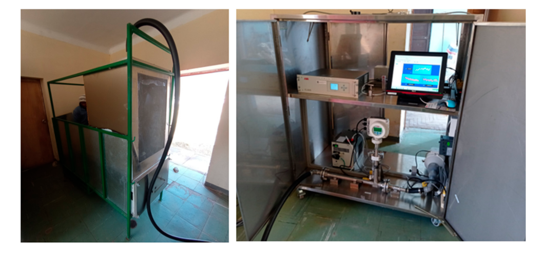
Figure 1. Mobile open-circuit respirometry system used for alpacas in the present study. The head hood is attached to the front structure of the metabolism crate.

system for gases and airflow and a gas cooler to remove moisture from the collected air sample. The instruments were installed on a mobile cart to make the system portable (Figure 1).